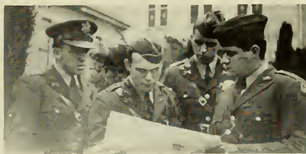
Cadet Officers Read News of Japanese Attack*