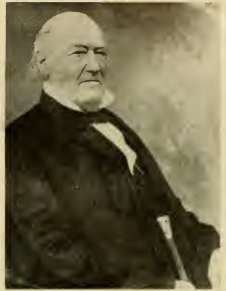
THOMAS EWING University's first graduate

On into the administration of Martin Van Buren, Blair