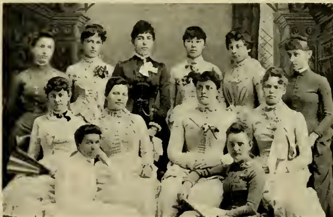
KAPPA ALPHA THETA GIRLS OF 1886