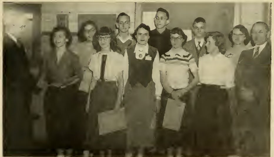
HIGH SCHOOL HISTORY TEST'S TOP TEN from more than 100 finalists