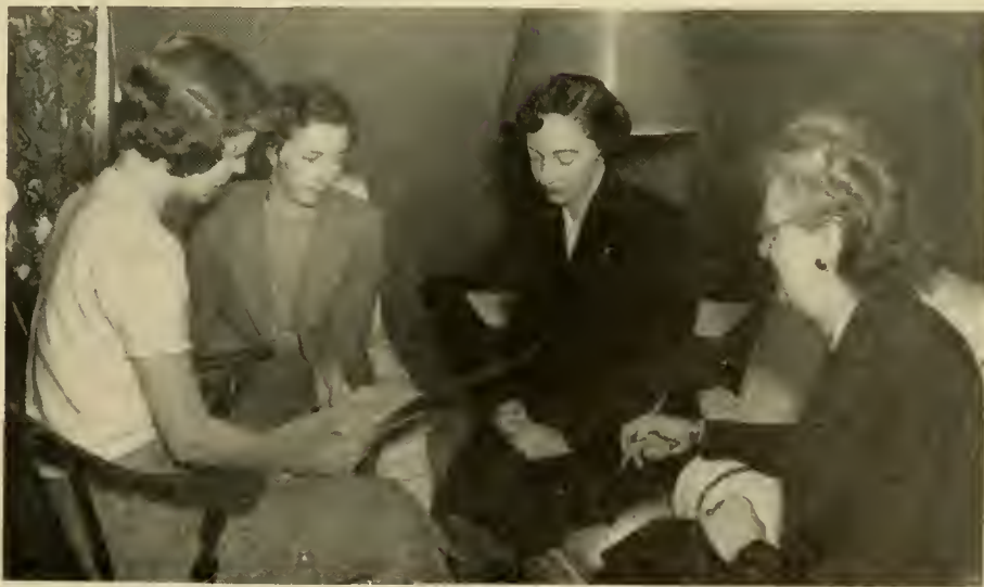
TOTAL EDUCATION IS THE CONCERN