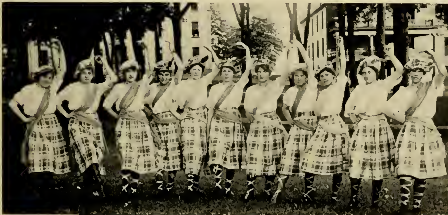
SCOTTISH DANCERS AT CENTENNIAL IN 1915 . . . a few of the 800 participants

The "needed funds" were found partially by letting out the grandstand and program concessions, the former to