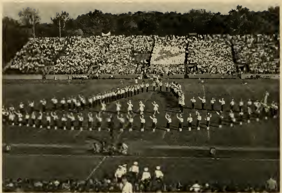
THE OHIO UNIVERSITY MARCHING BAND . . . a western hat for Western Reserve

It is near the end of another year, and I hope that each of you will have a very Merry Christmas, a Happy New Year—and that "1951" will be a happier year for all.