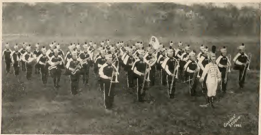
Ohio's Newly Uniformed Fifty-Piece Band

"Men students at Otterbein wear garters. At least that is the information that the Ohio delegation to the student conference brought back with them. The men wear hats on all public occasions, and are never seen nudeheaded on the streets. And the widest trouser-bottoms that the delegation noticed could not have possibly measured over sixteen inches.