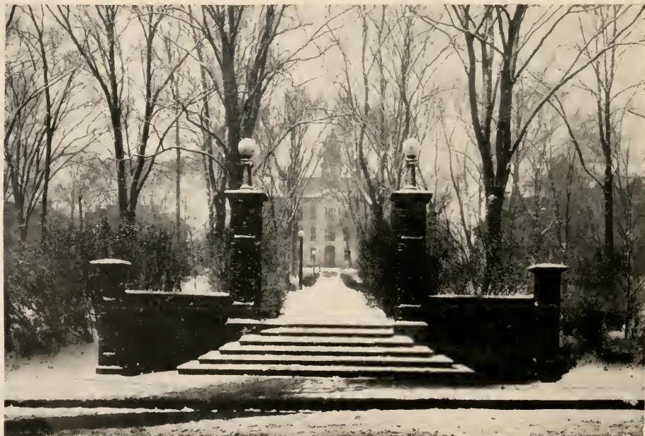
The First Snow of the Season

Another announcement received immediately before going to press is that of a meeting of the Southern California chapter to be held on December 18 in Los Angeles. The dinner will be served at the Windsor Tea Room, 527 West Seventh Street. This will be the second annual gathering since the organization of the chapter. Forty Ohioans were in