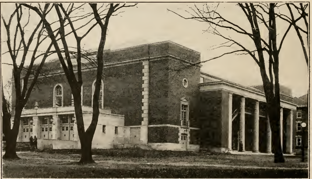
The Alumni Memorial Auditorium As It Is Today—Ready for Dedication

All will be in readiness on January 20 for the dedication of the big auditorium. Only a few details of equipment remain to be attended to and these, it is anticipated, will be disposed of before the end of the present year.