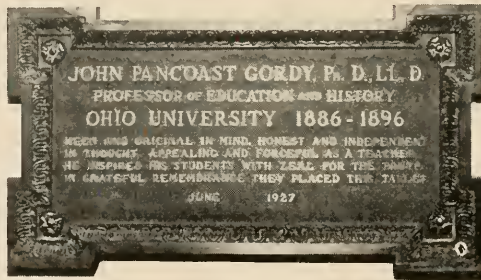
Gordy Memorial Tablet