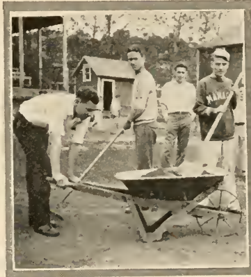
Student Athletic Managers

Seventy-one more men have enrolled in the College of Education for this semester than were enrolled at the same time last year. This increase in the male enrollment has taken place largely in the School of Physical Education where the work and facilities of the school are attracting widespread attention. The total enrollment of 2,213 this year is a gain of 145 students over that of the preceding year.