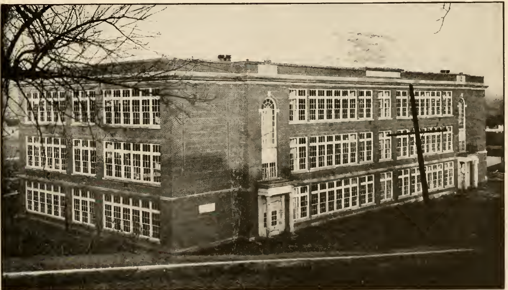
Putnam Hall—In Which Is Located the Ohio University Kindergarten

Thus the child actually practices personal cleanliness in his course in health science, as cleaning the teeth and washing the hands and face before and after each meal. Even the three-year-olds soon learn to recognize their (Continued on Page 31)