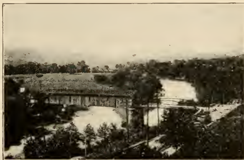
"Old South Bridge"

Beneath the stadium and to the west of the concourse will be the dressing rooms, rest rooms, supply rooms, boiler rooms, and storage rooms. Beginning at the southern end of the unit there will be a room, 18 by 36 feet, for the heating and hot water equipment; a room 9 by 18 feet for and coaches and officials; a men's toilet 18 by 36 feet; a main entrance 12 feet wide; a room 36 by 62 feet to be used