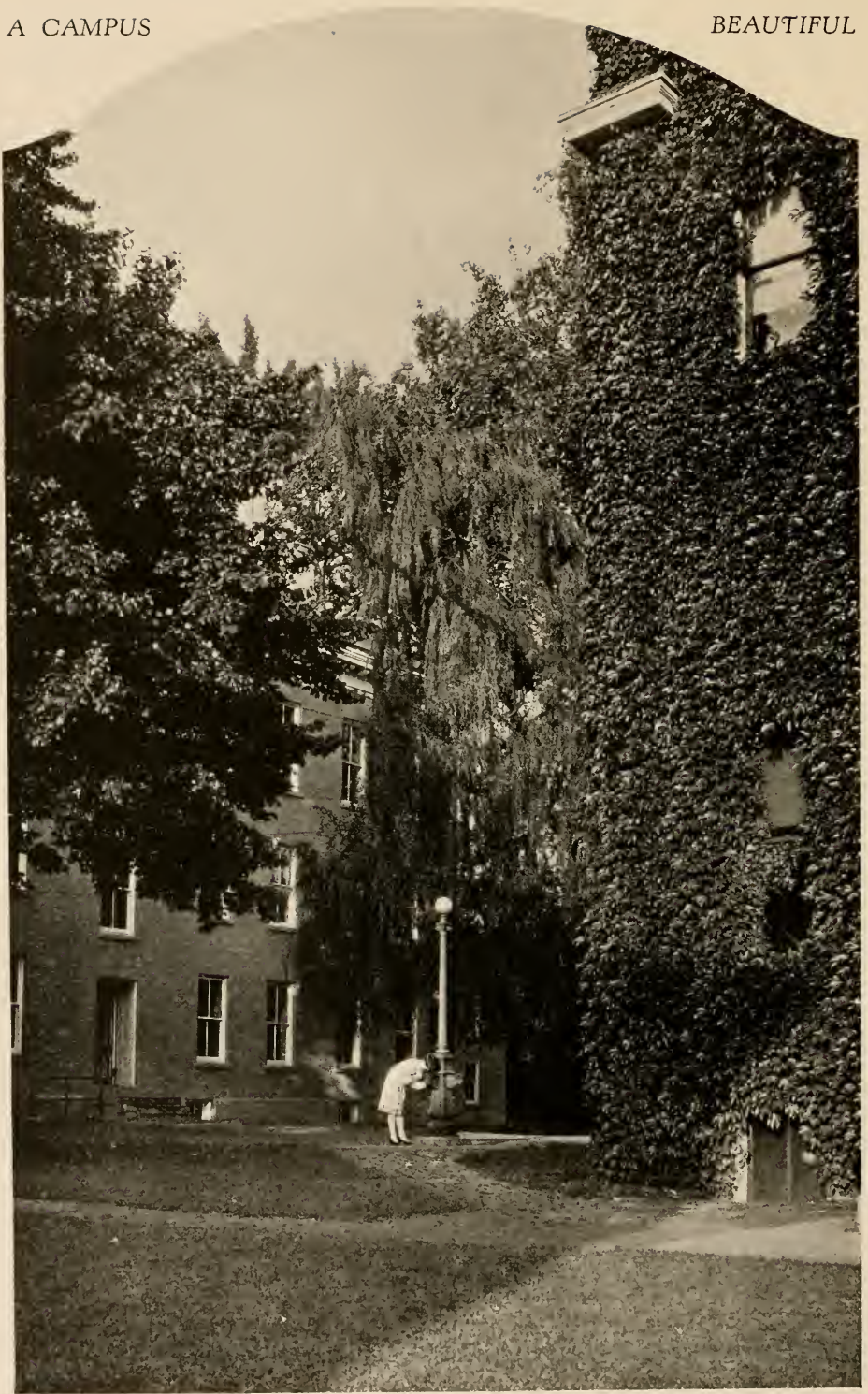
Class of 1911 Drinking Fountain and the Napoleon Willow