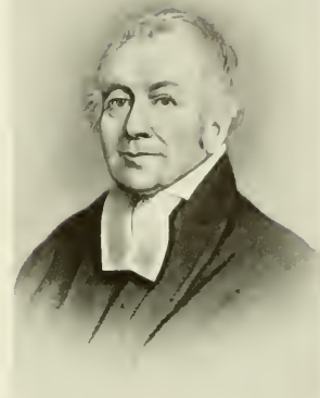
MANASSEH CUTLER, LL. D.

lead him to a study of botany and astronomy. In the former subject, particularly, he became most learned and was one of the foremost authorities of his time. He became acquainted with the presidents and faculties of Harvard, Yale, New Jersey College (Princeton), and what is now the University of Pennsylvania. He was known for his studies both in America and abroad and from all sources he sought information to increase his knowledge.