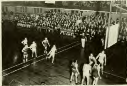
OHIO GETS A FREE SHOT IN WITTENBERG GAME

The season will probably have come to an end before this issue of the Alumnus is in the readers' hands. Conference contests with Cincinnati and Marshall remain to be played at this writing.