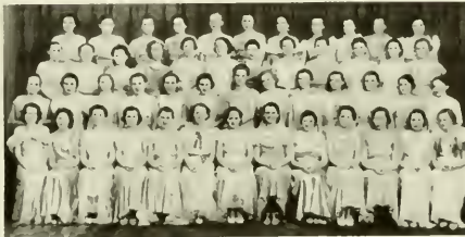
WOMEN'S GLEE CLUB