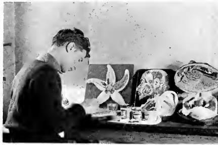
N.Y.A. ARTIST AT WORK ON MODELS