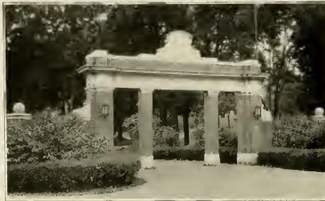
"So Enter that Daily Thou Mayest Grow in Knowledge"

The Republicans plus the conservative Democrats have enough votes to prevent the Administration from putting over any more New Deal experiments. At the same time Mr. Roosevelt can veto any legislation he does not like and neither branch will override him. This means that the New Deal program as it now stands will probably not be amended in any