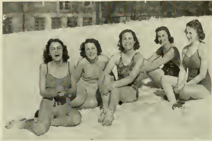
There's Warmth in Those Smiles — But the Snow? B-r-r-r!