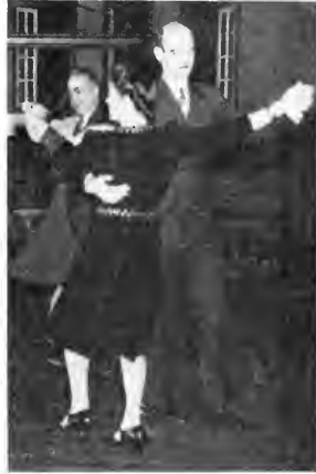
Faculty Members Cut Capers

R. O. T. C. training will be continued at Ohio University as at present until the Army Specialized