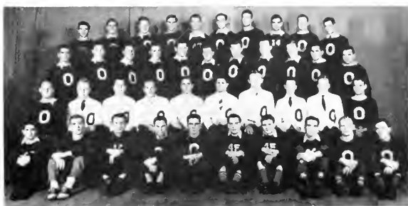
Varsity "O" Club—Lettermen in Sports