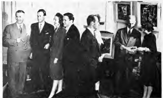
Ohioans Preview Rood Paintings at Eggleston Gallery