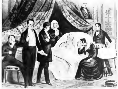
DEATH OF HARRISON, APRIL 4, A.D. 1841