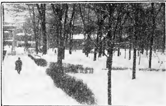
THE CAMPUS IN WINTER

become a fad upon the campus. It may be added, however, that the practice is entirely without the sanction of the three Greek letter groups who have suffered heavily at the hands of some light-fingered criminals or practical jokers with a misguided sense of humor. In the