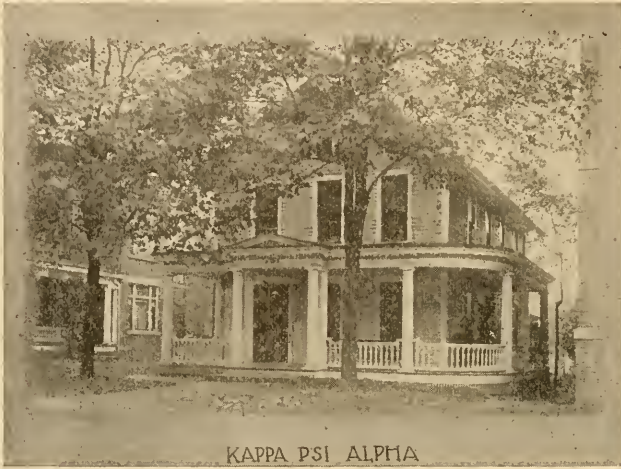
KAPPA PSI ALPHA

because of any greater interest in it than in the other departments but because its growth is typical of the growth and expansion of the University as a whole and the evidences of the fact may be had in a statistical form. The figures just released from Director Copeland's office show marked increase of 61.2% in the