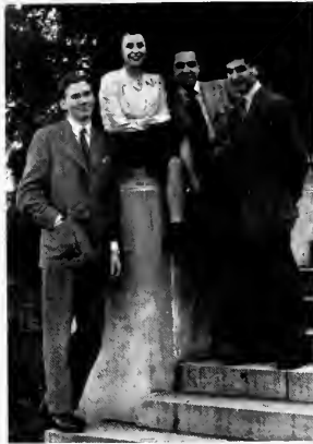
Student Center Committee