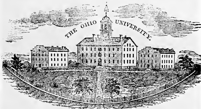
Ohio University as It Appeared to an Athenian in 1838

While General Putnam was engaged in creating the physical institution, Dr. Cutler was busy planning its organization and developing policies for it. The charter was modeled after that of Yale with which Cutler was best acquainted. Because of their intimate association with the steps which brought Ohio University into being, Putnam and Cutler are regarded as co-founders of the school.