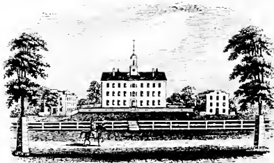
"OHIO UNIVERSITY AT ATHENS"