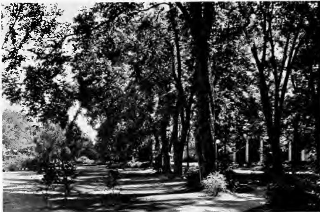
The "McGuffey Elms" Planted in 1839 (See Poem on Opposite Page)