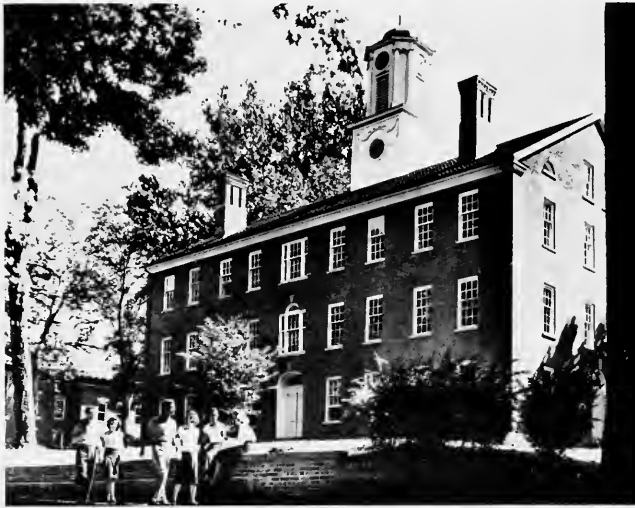
CUTLER HALL — BUILT 1816 — REDEDICATED 1947

Courses will be offered in all phases of the regular program including: