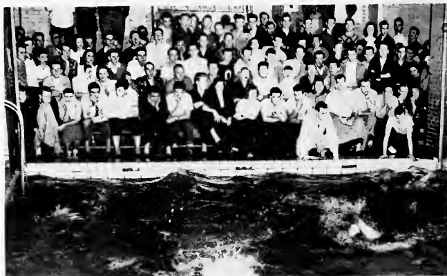
Varsity Swimmers Stage Intercollegiate Meet in Under-sized Pool