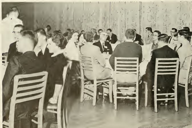
CONTEST BANQUET was held after examinations were completed. Awards were made at a special convocation the following day.