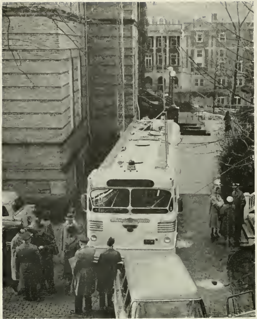
MOBILE RADIO BUS, parked at corner of Ewing Hall, served as communications center for the Civil Defense Drill.

The students of Ohio U. volunteered help to make the trial run go smoothly. Various student organizations had representatives taking part in the day's activities. Interfraternity Pledge Council, the Veteran's Club and some 200 ROTC cadets helped with the Civil Defense drill.