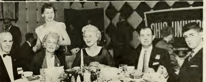
→ DETROIT ALUMNI are shown in the series of photographs at the right, taken at their December dinner meeting.