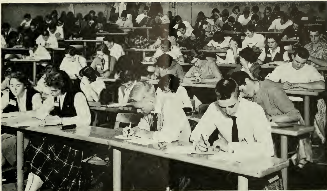
HIGH SCHOOL STUDENTS COMPETE IN FINAL EXAM OF OHIO HISTORY, GOVERNMENT AND CITIZENSHIP CONTEST.