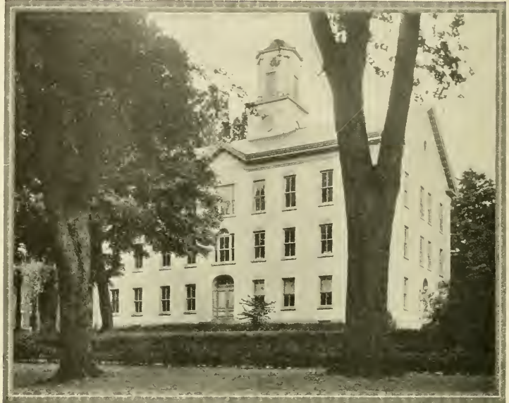
MANASSEH CUTLER HALL — ERECTED IN 1817