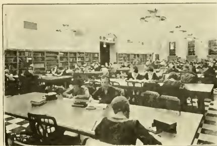
MAIN READING ROOM OF CHUBB LIBRARY

Men's Glee Club, Feb. 14; Girls' Glee Club, Feb. 25; Symphony Orchestra, Feb. 28; University Choir, March 5; and the Concert Band, March 13.