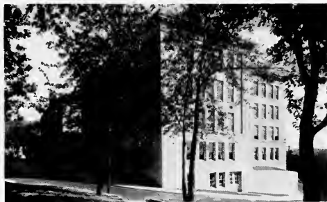
Men's Gym (left) and Super Hall

to be taken care of in the building program. The auditorium is in use a great part of the time since it is the main auditorium on the campus. It is used for general student convocations, rehearsals and concerts by the university band, orchestra, choir and glee clubs, graduation exercises, major productions by the University Theater, concerts by out-of-town artists and musical organizations, and at times it serves community needs for a large auditorium. Due to insufficient appropriations for maintenance during the last six or seven bienniums, Ohio University has been unable to make needed repairs and to provide adequate upkeep for this building. It is in need of redecoration, a new stage curtain, and stage