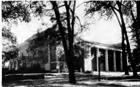
Alumni Memorial Auditorium

both men and women students. This makeshift has proved inadequate to serve even the minimum needs and requirements of the student body. For years, the students themselves have been attempting to find the means of achieving a student center building and have raised some funds toward this end. The need is such, however, that it does not seem feasible to wait for adequate funds to be raised in this manner. The building will be located on the site of the present center and will include, in addition, the areas now occupied by the Men's Faculty Club and O'Blens property, to the west, and the Women's Faculty Club, to the north.