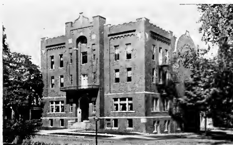
Student Union Building (To be replaced?)

Museum Building —To construct and equip a building to house and preserve the oldest and one of the most valuable historical museums in the Northwest Territory. Building to be one story and basement construction, 60 feet by 100 feet, and 30 feet in height. Estimates: structure, $90,000; equipment, $10,000; total, $100,000.