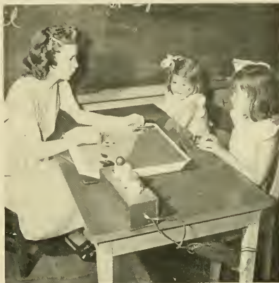
Sound Discrimination Taught Through Ear Training

Ohio University's speech clinic has good equipment, and more is on order. The present equipment includes a "sound mirror," which records the voice on an endless steel tape, playing it back to the listener at any time.