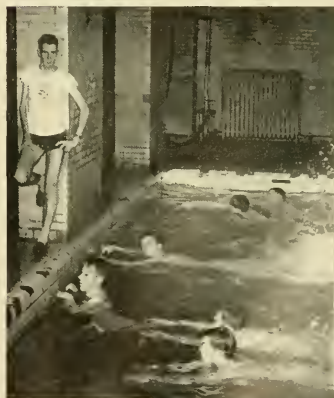
Disabled Veterans Enjoy a Swim

Various methods are employed to (Continued on Page 7)