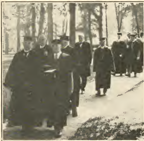
The Academic Procession