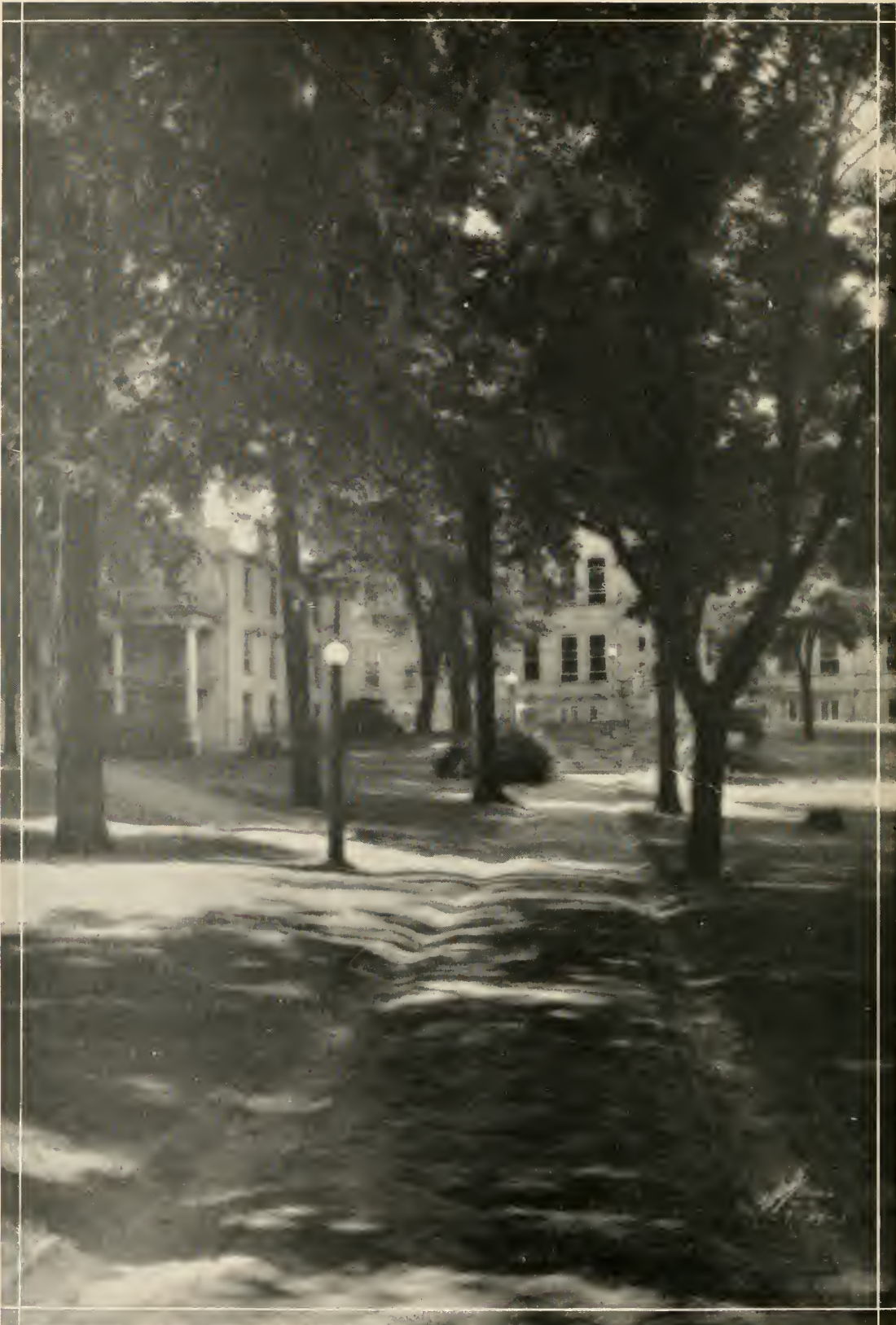
A Familiar Walk and a Familiar Hall