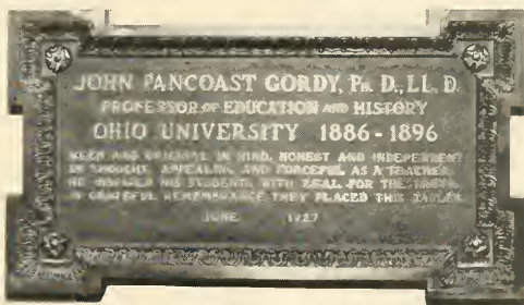
The Gordy Memorial Tablet