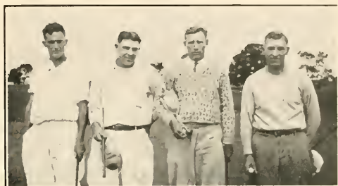
Four Golf "Bugs"