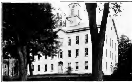
MANASSEH CUTLER HALL — ERECTED IN 1817

side by side with the right of jury trial, habeas corpus , inviolability of private contracts, and other essential safeguards" in the minds of the writers of the Ordinance.