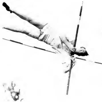
WESTERVELT TOPS BAR AT 12' 1"

The complete spring athletic program is: March 24, baseball, Michigan State, here; March 30, April 2—Illinois, here; April 7, Ohio State, here; April 10—Marietta, here; April 13-14, West Virginia, away; April 14, track, Ohio Wesleyan, here; April 17, baseball, Marshall, away; April 20—(Continued on page 11)