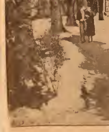
ber the McGuffey Elias, planned in 1839 by the famous author of the McGuffey Readers.