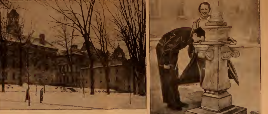
Manssah Cutler hall, center, built in 1817, and the east and west wings are the oldest buildings on the campus.