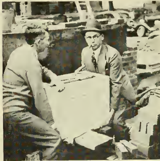
CORNERSTONE FOR MEN'S DORMITORY

T HE GENTLEMEN in the accompanying picture are about to call upon masons to set the corner stone of the dormitory for men now in the process of construction on Uni-