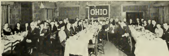
Alumni in the Nation's Capital Gather at the Festal Board