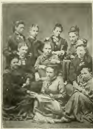
Ohio University Co-Eds of Early Days

And in the serving gain your key key to paradise.