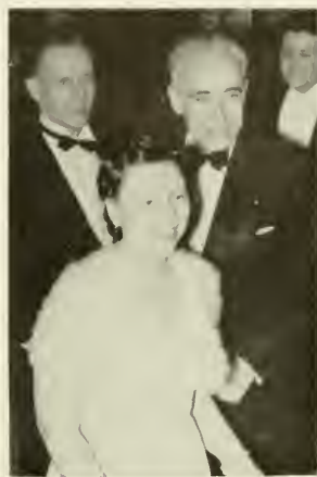
Author-Playwright Erskine (right)