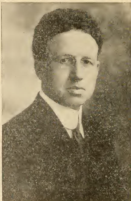
HARRY EMERSON FOSDICK, D. D.

The Senior-Alumni convocation which proved to be a successful innovation last year, will be repeated. At noon will occur the Luncheon Reunions of the va-