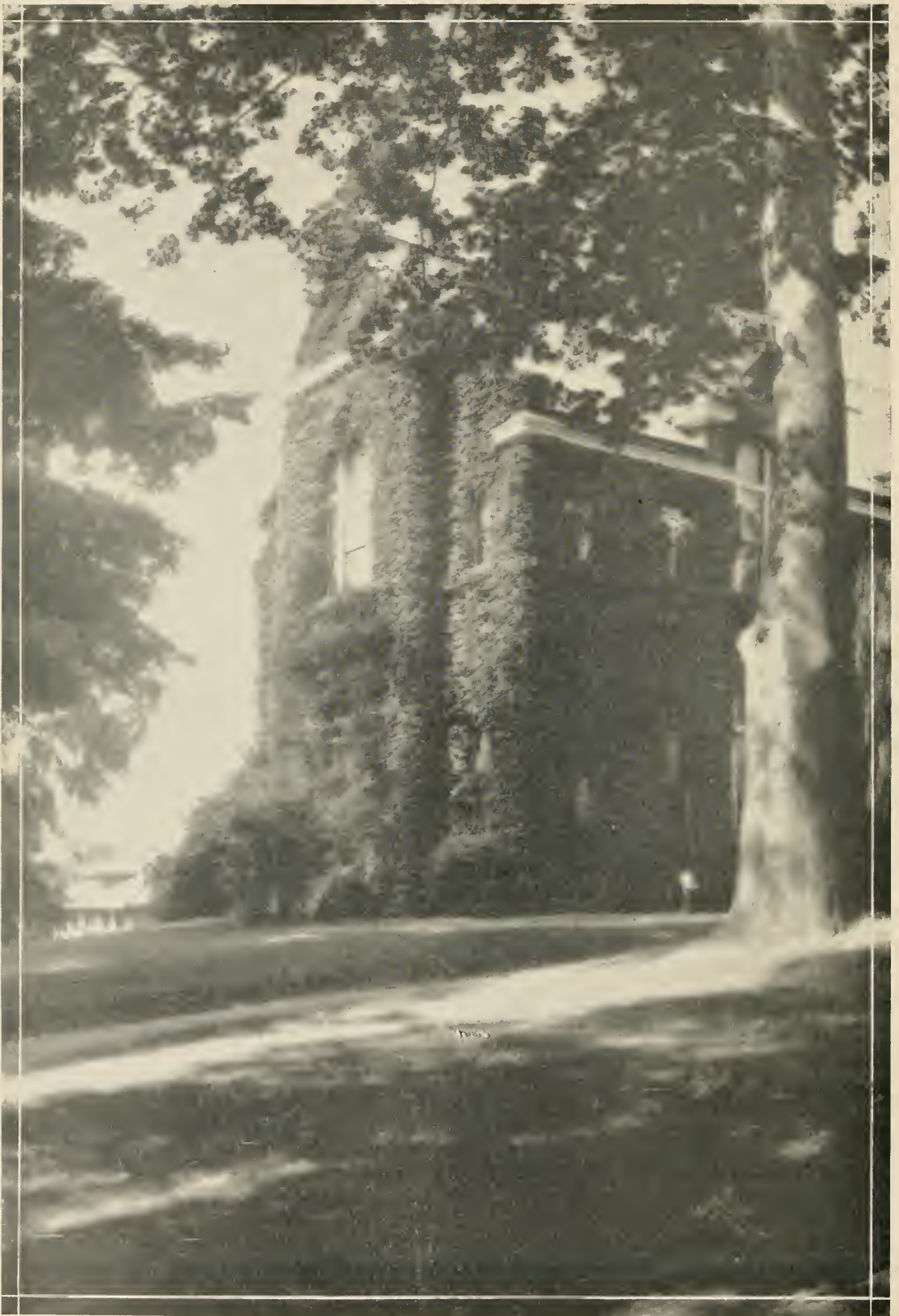
Hall of Fine Arts In Its Spring Dress