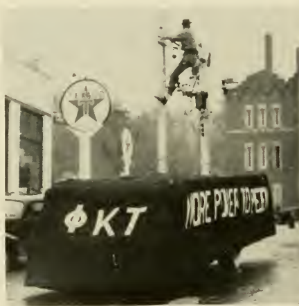
Phi Kappa Tau's Say "More Power to Peden"

Easier going was encountered in the Ohio-Miami