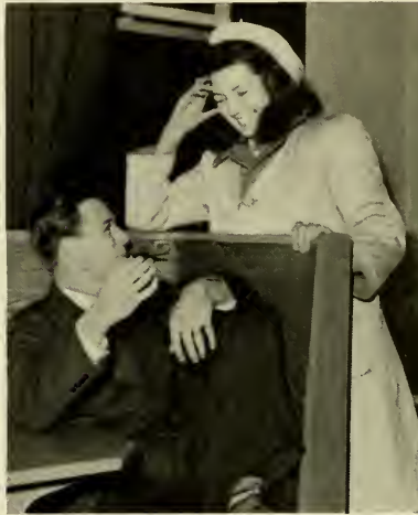
Campus Camaraderie in a Grill Booth

FOR THE second consecutive year, Zeta Tau Alpha sorority will bring a musical production to the campus as a part of a nation-wide effort to bring culture to grade school children. Last year the ballet, "Pinocchio," was presented before a crowd of youngsters that packed Alumni Memorial Auditorium. This year's offering, produced by Junior Programs, Inc., is Rimsky-Korsakoff's opera "The Bumble Bee Prince."