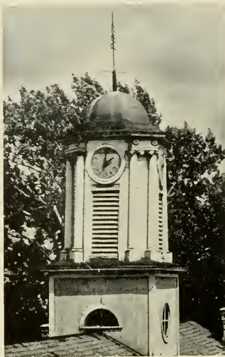
Cutler Tower—"A Friend in Need"

BEGINNING next semester, Ohio University students will have an