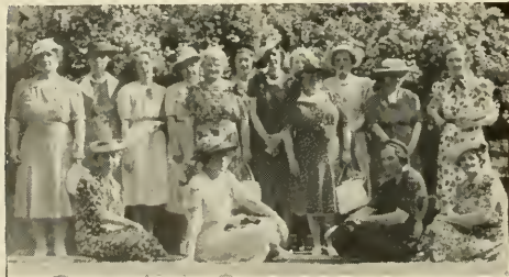
Ohio University Mothers' Club of Cleveland