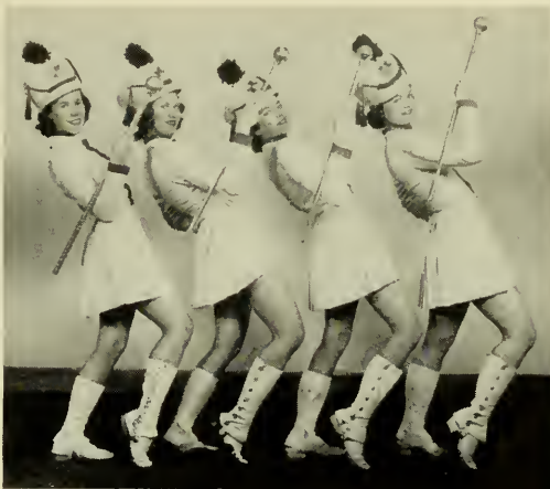
The Band's Four Comely Majorettes Strut Their Stuff