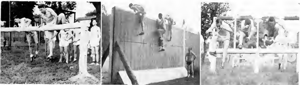
Students Stretch Their Muscles on New "Commando Course" in Physical Fitness Program