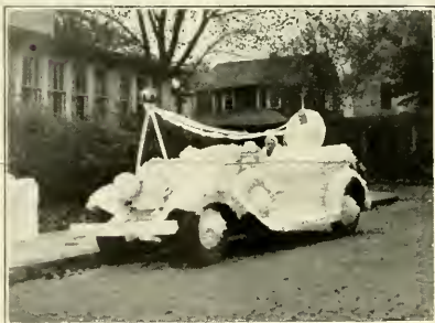
AN ENTRY IN THE HOMECOMING PARADE

More than 25 sorority and fraternity houses were decorated in competition for the most attractive home. The cup presented by the Men's Union was awarded to Tau Kappa Epsilon fraternity. Theta Chi