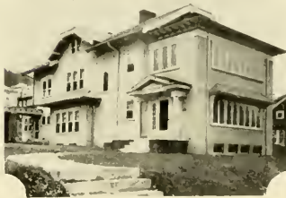
TAU KAPPA EPSILON

Those which amount to the remitting of entrance fees for the year were granted to four freshmen on the basis of standing in the state competi-