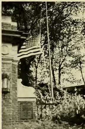
UNIVERSITY FLAG AT HALF MAST

mentary school to president of a college in twenty-three years. He taught in the elementary and high schools of Indiana from 1882 to 1892, and held his first administrative position in 1893 when he became principal of Kokomo High School. He later resigned to become a teacher in the Manual Training High School of Indianapolis. One year later he was appointed professor of social and economic science in Butler College.