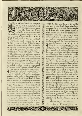
PRAYER OF DEDICATION

Give us, O God, a lively appreciation of our high privilege and a keen sense of our personal and social responsibilities and obligations. And let the beauty of the Lord, our God, be