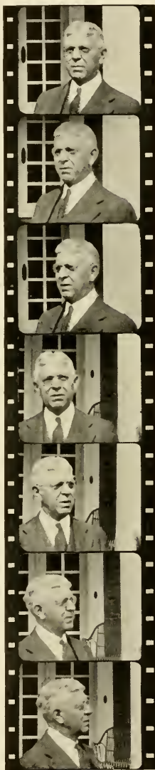
MOODS — AS CAUGHT BY THE MOVIE CAMERA