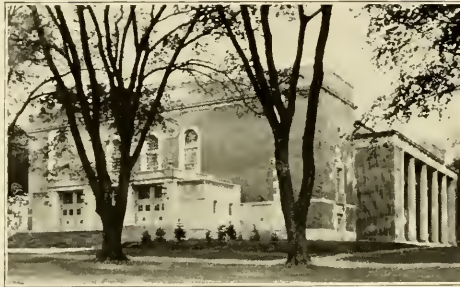
ALUMNI MEMORIAL AUDITORIUM