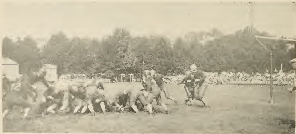
Bobcats Plunge Rio Grande Line For Season's First Touchdown