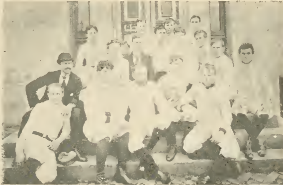
Ohio's First Football Team—1895