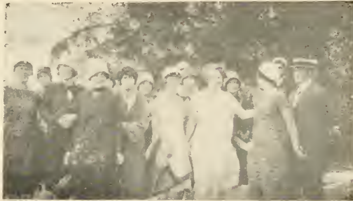
Ohio Girls in Finland

One of the oldest trees on the campus and a member of the historic group of McGuffey Elms, was cut down by Davey tree surgeons,