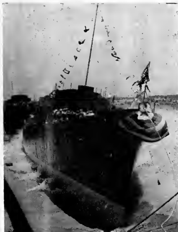
The "U.S.S. Severin Rombach" is Christened