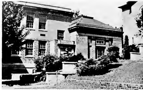
Northeast Entrance, Carnegie Hall

which it initiated this month. The initial offerings include a course in Elementary Aviation designed primarily for elementary school teachers who wish a general knowledge of the field. Other courses include Aircraft Engines, Fundamentals of Radio, Elementary Meteorology, Elementary Navigation, engineering courses pertinent to a major in aeronautical engineering, and a Controlled Private Ground course and a Controlled Private Flight course. All courses are