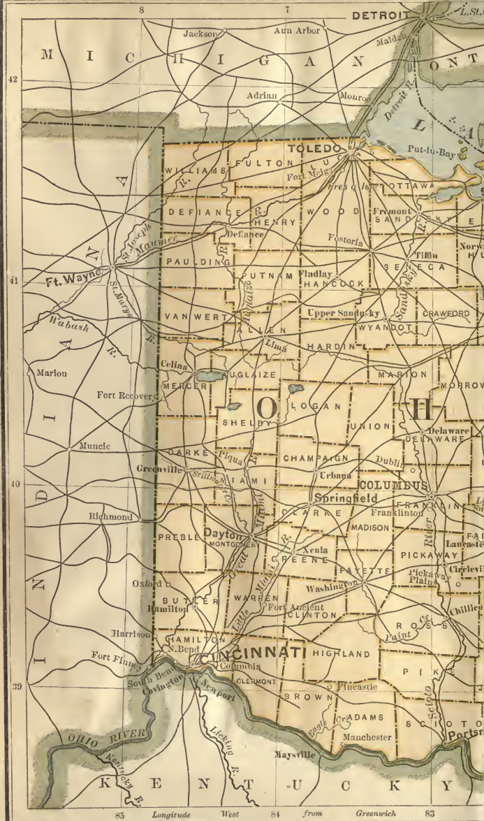
MATTHEWS, NORTHROP & CO