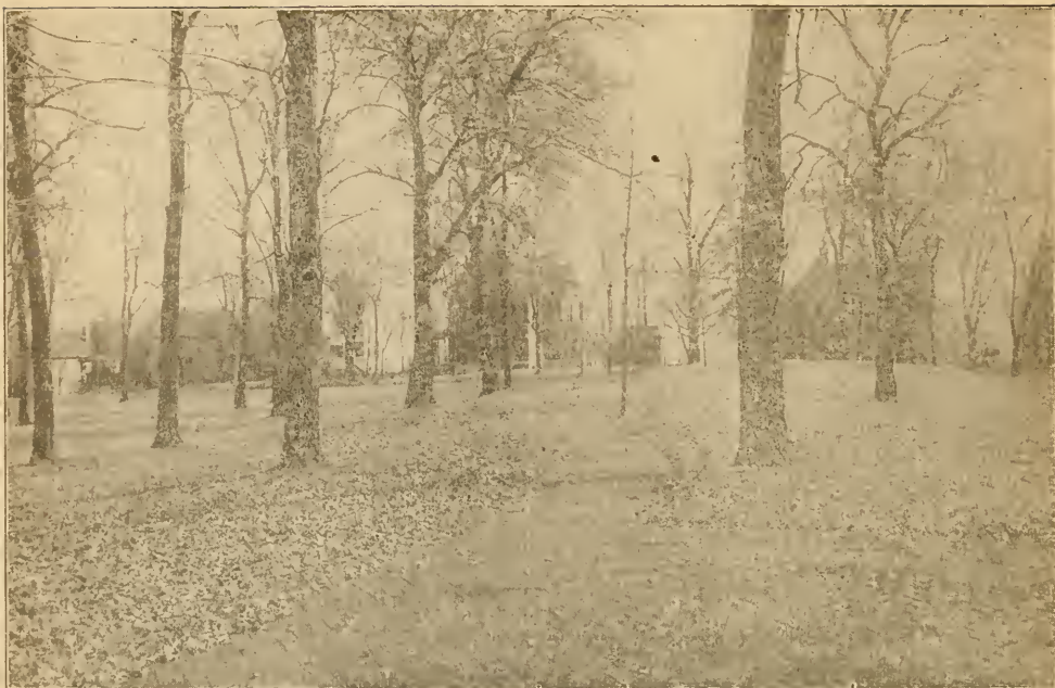
A FAMILIAR CAMPUS VIEW