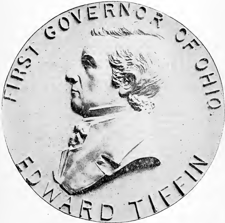
GOVERNOR EDWARD TIFFIN

Governor Tiffin traveled horseback from Chillicothe to Athens to open the sessions of the first Board of Trustees of Ohio University.