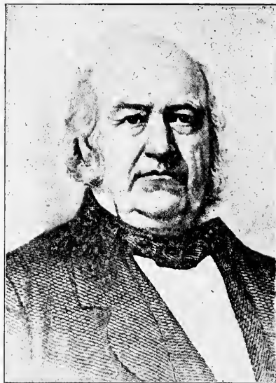
HON. THOMAS EWING Ohio's First Graduate

"And generations yet untold Strive upward, body mind and soul Toward Light and Truth and God."