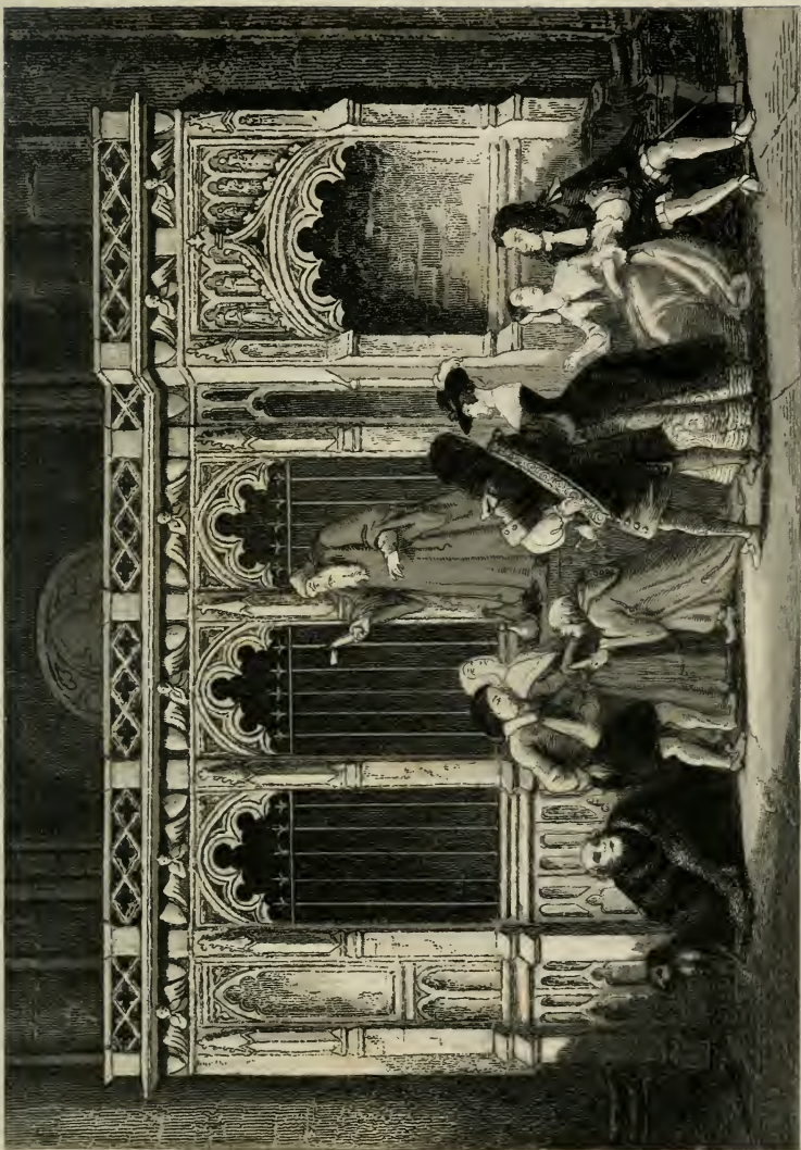
Blaise Purchasing the Infallible Antidotes.