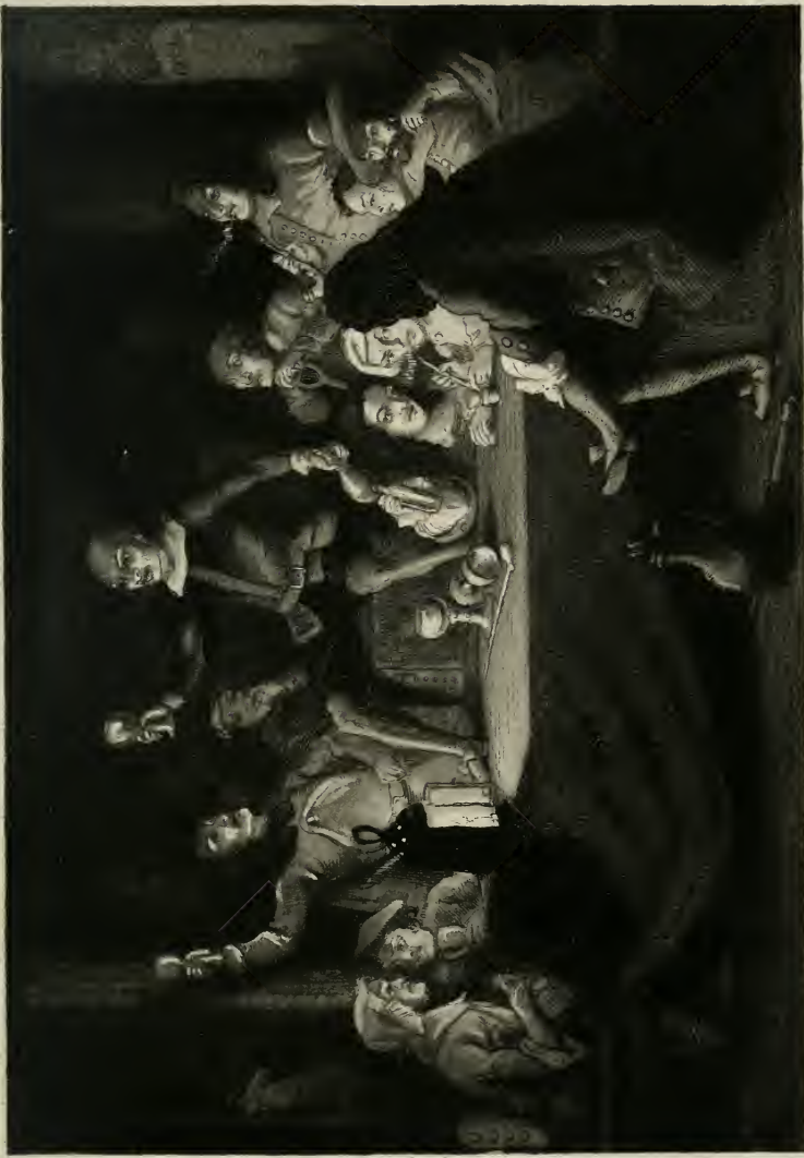
The Coffin Maker's Carousal.