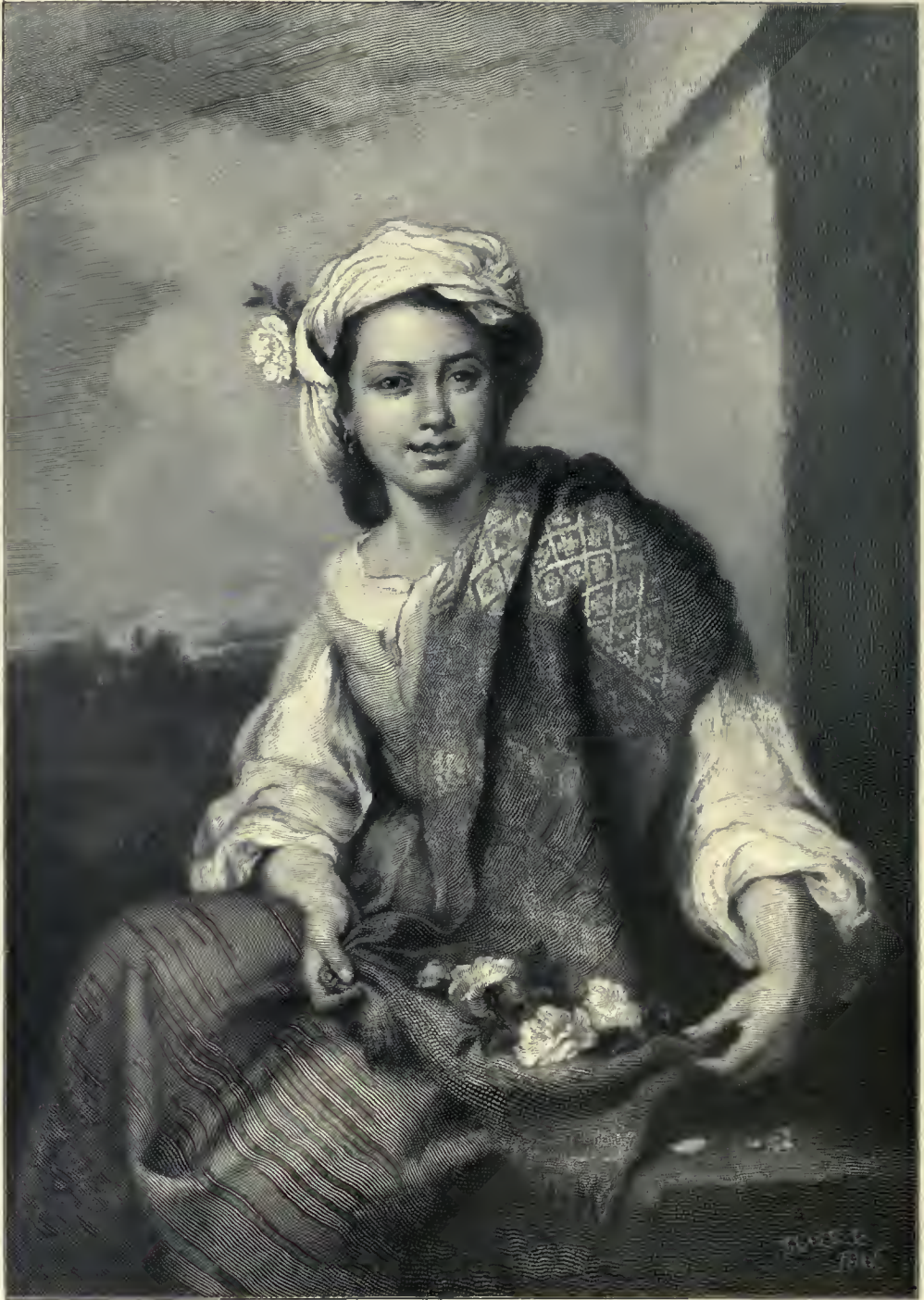
A SPANISH FLOWER-GIRL. BY MURILLO. IN THE GALLERY OF DULWICH COLLEGE, ENGLAND.