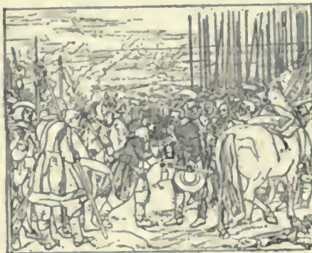
KEY OF "THE SURRENDER OF BREDA"

"The Surrender of Breda," from which I have engraved the detail of the principal characters, was painted by Velasquez for King Philip IV in