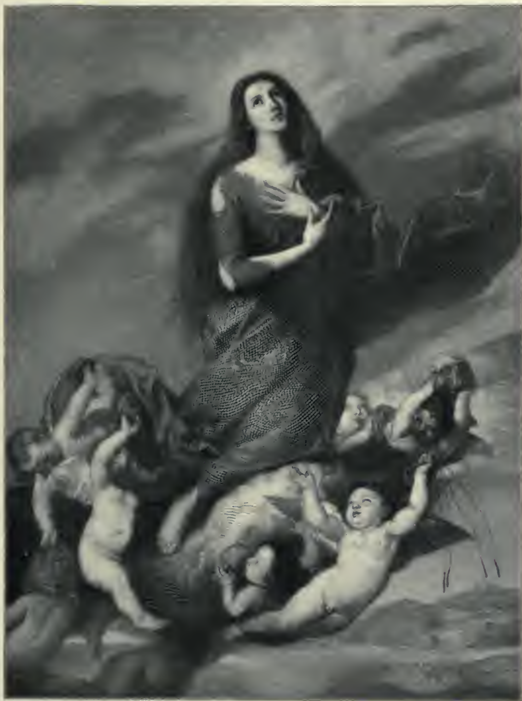
THE ASSUMPTION OF MARY MAGDALENE. BY RIBERA. IN THE REAL ACADEMIA DE BELLAS ARTES, MADRID.