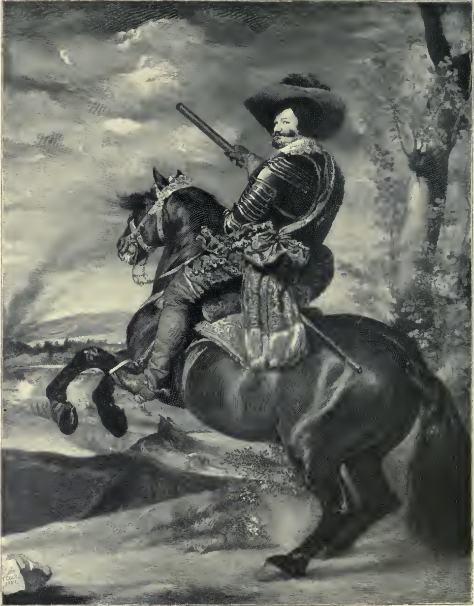
DON OLIVAREZ. BY VELASQUEZ. PRADO MUSEUM, MADRID.