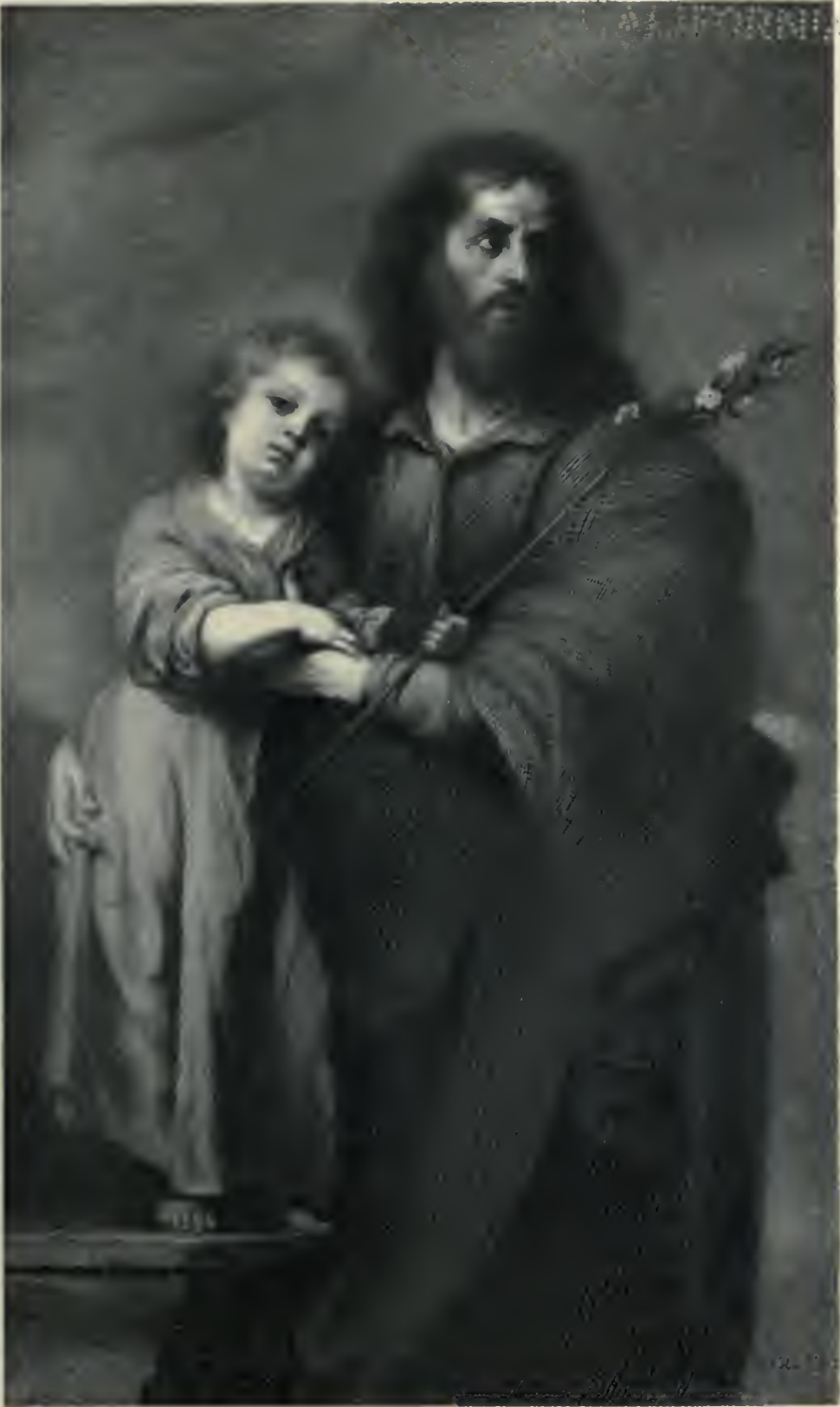
ST. JOSEPH AND CHILD. BY MURILLO. SEVILLE MUSEUM.