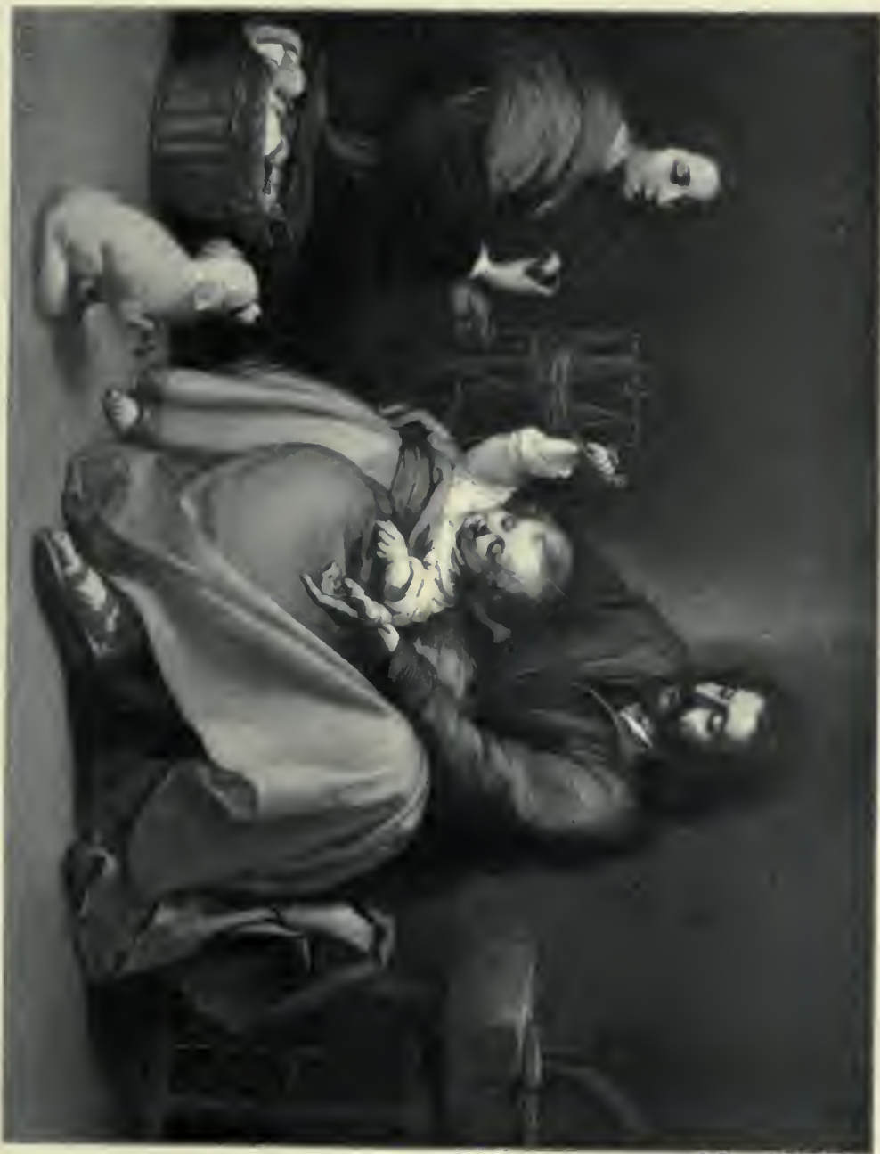
THE HOLY FAMILY OF THE LITTLE BIRD. BY JERRILLO. PRADO MUSEUM, MADRID.