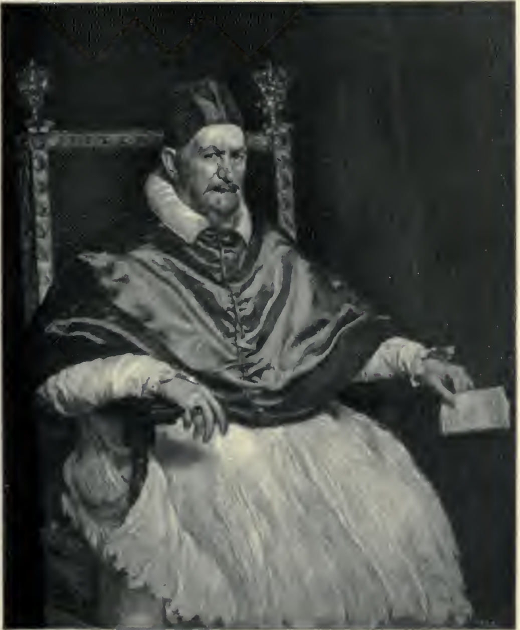
POPE INNOCENT X. BY VELASQUEZ. IN THE SPINIA PALACE, ROME.