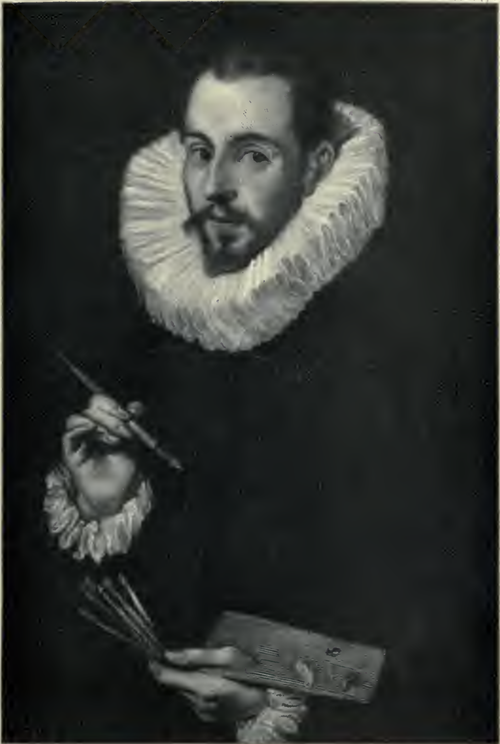
EL GRECO (DOMENICO THEOTOCOPULI). BY HIMSELF. SEVILLE MUSEUM.