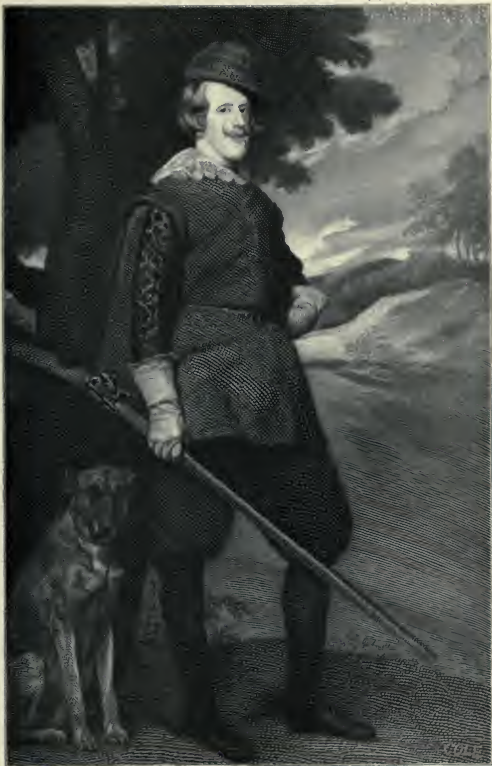
PORTRAIT OF KING PHILIP IV AS A SPORTSMAN. BY VELASQUEZ. FRANCO MUSEUM, MADRID.