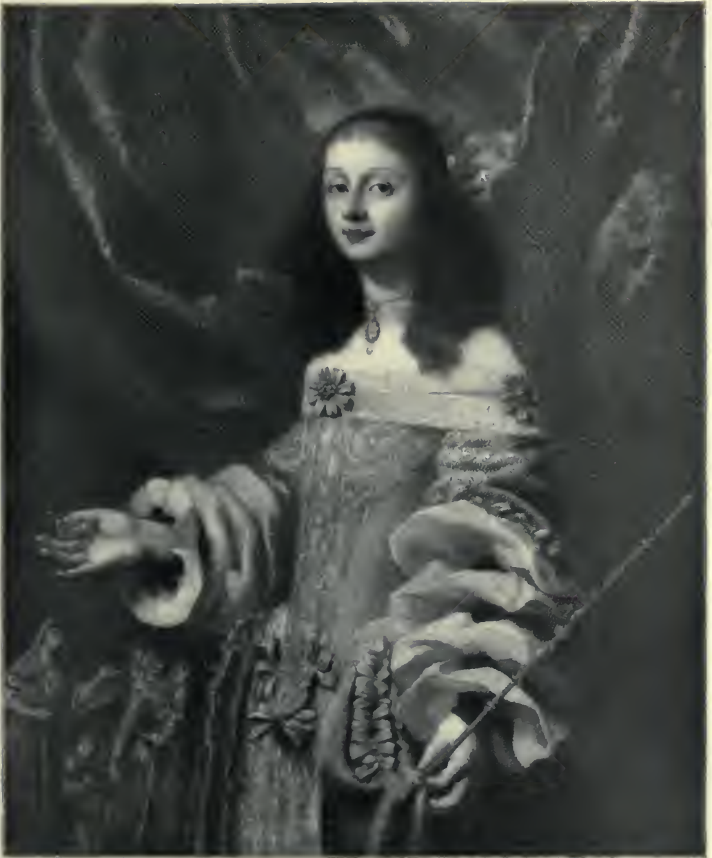
ST. ELIZABETH. BY FRANCISCO ZURBARAN. IN THE SMITH-BARRY COLLECTION, LONDON.