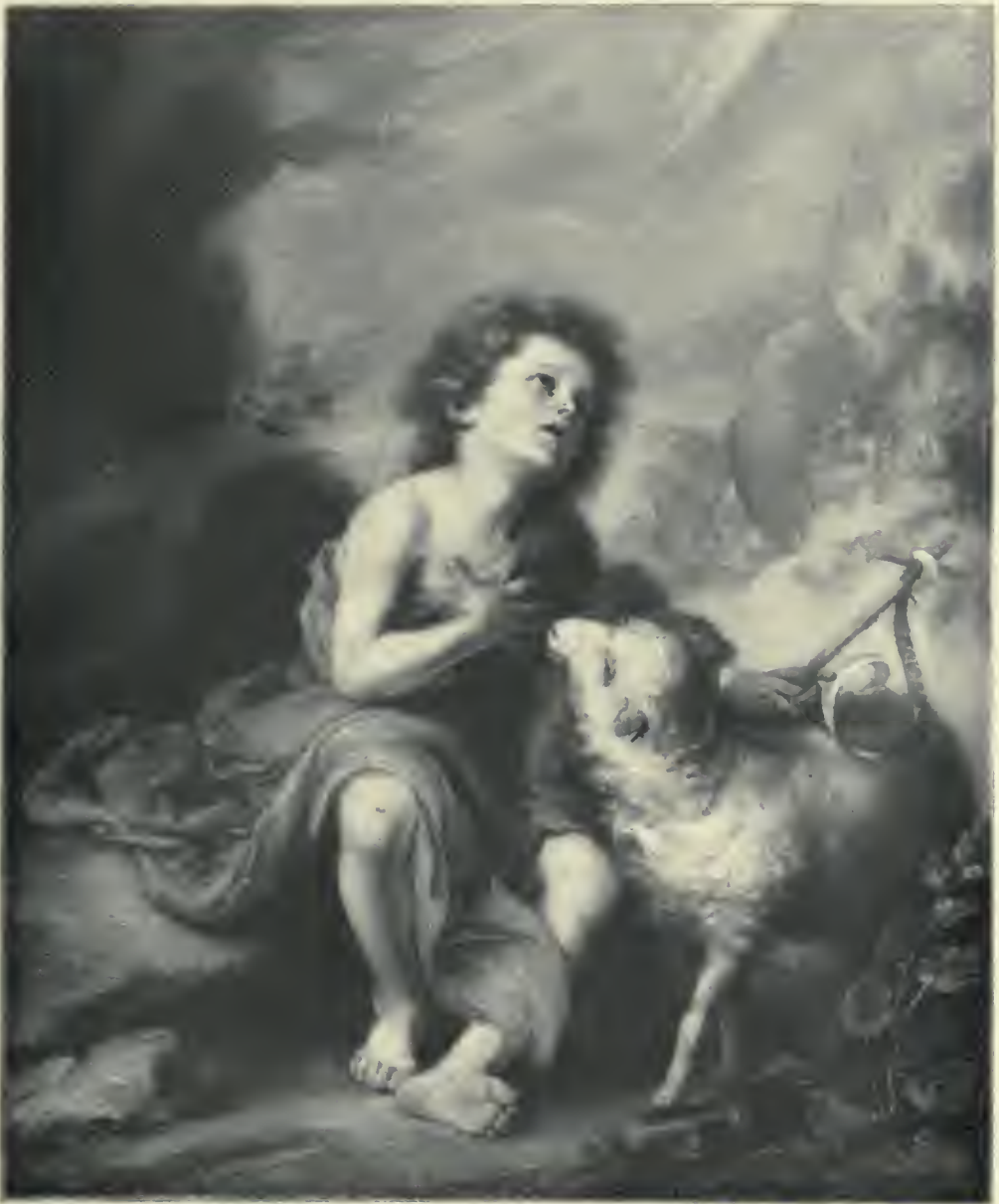
ST. JOHN THE BAPTIST. BY MURILLO. PRADO MUSEUM, MADRID.