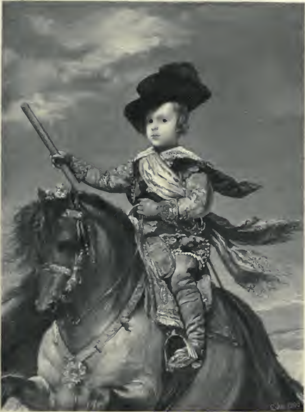
DON BALTASAR CARLOS (DETAIL). BY VELASQUEZ. MADRID MUSEUM.