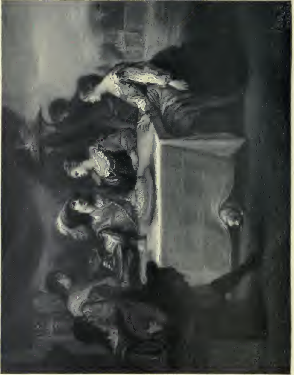
THE PRODIGAL SON FEASTING. BY MURILLO. PRADO MUSEUM, MADRID.