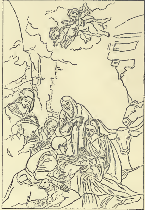
OUTLINE—MURILLO'S "ADORATION OF THE SHEPHERDS"

ment, in which the outlines are lost in the light and shade, as they are in the rounded forms of nature.