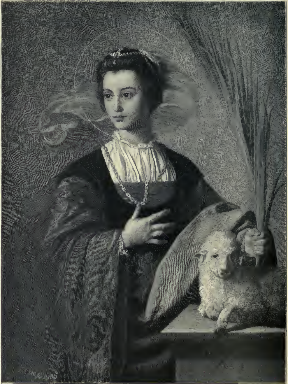
ST. AGNES. BY ALONZO CANO. BERLIN MUSEUM.