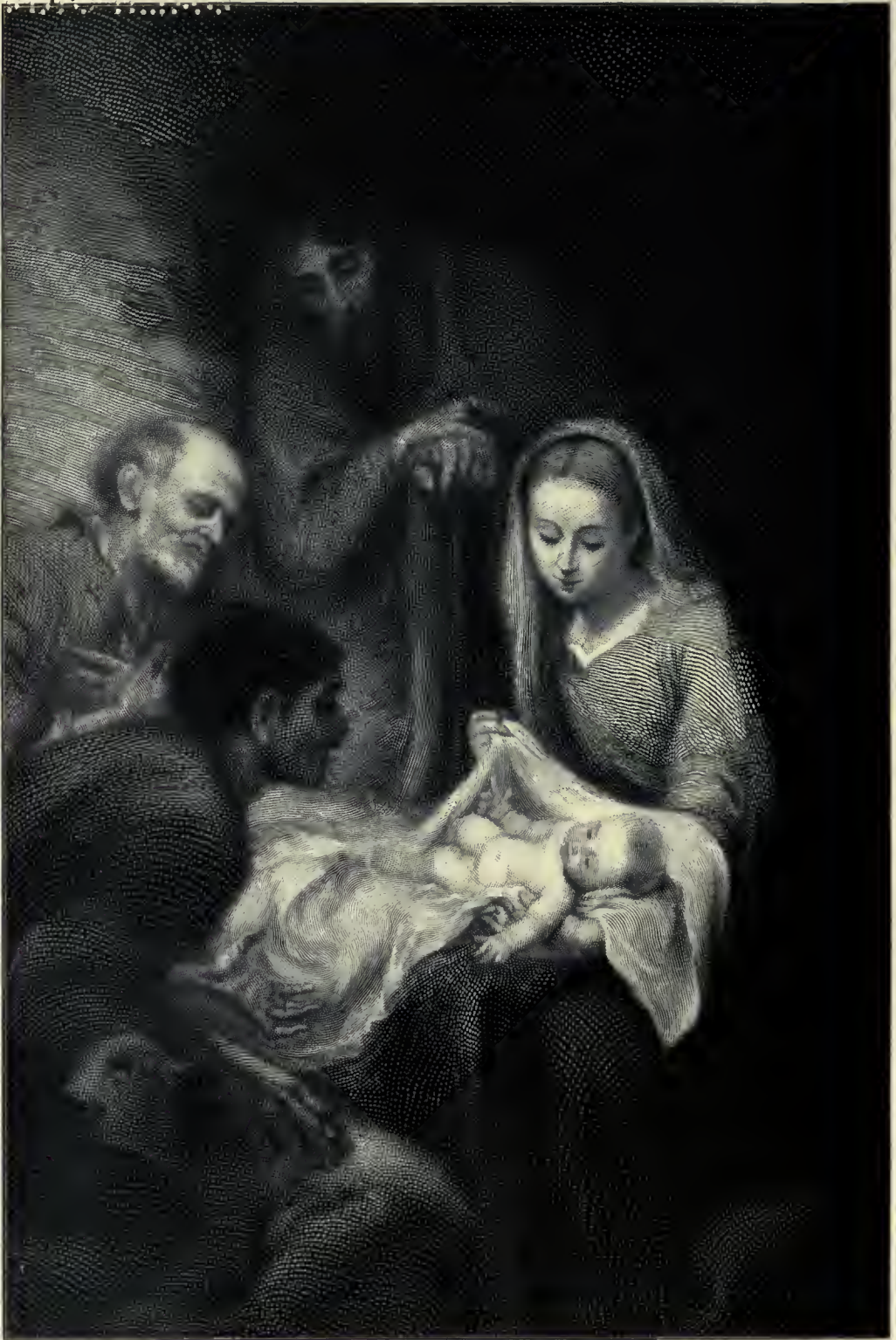
THE ADORATION OF THE SHEPHERDS. BY MURILLO. SEVILLE MUSEUM.