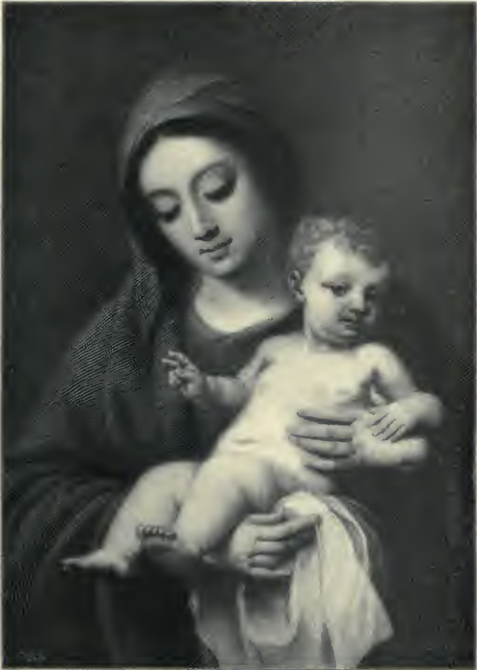
MADONNA AND CHILD. BY ALONZO CANO. IN THE CATHEDRAL OF SEVILLE.