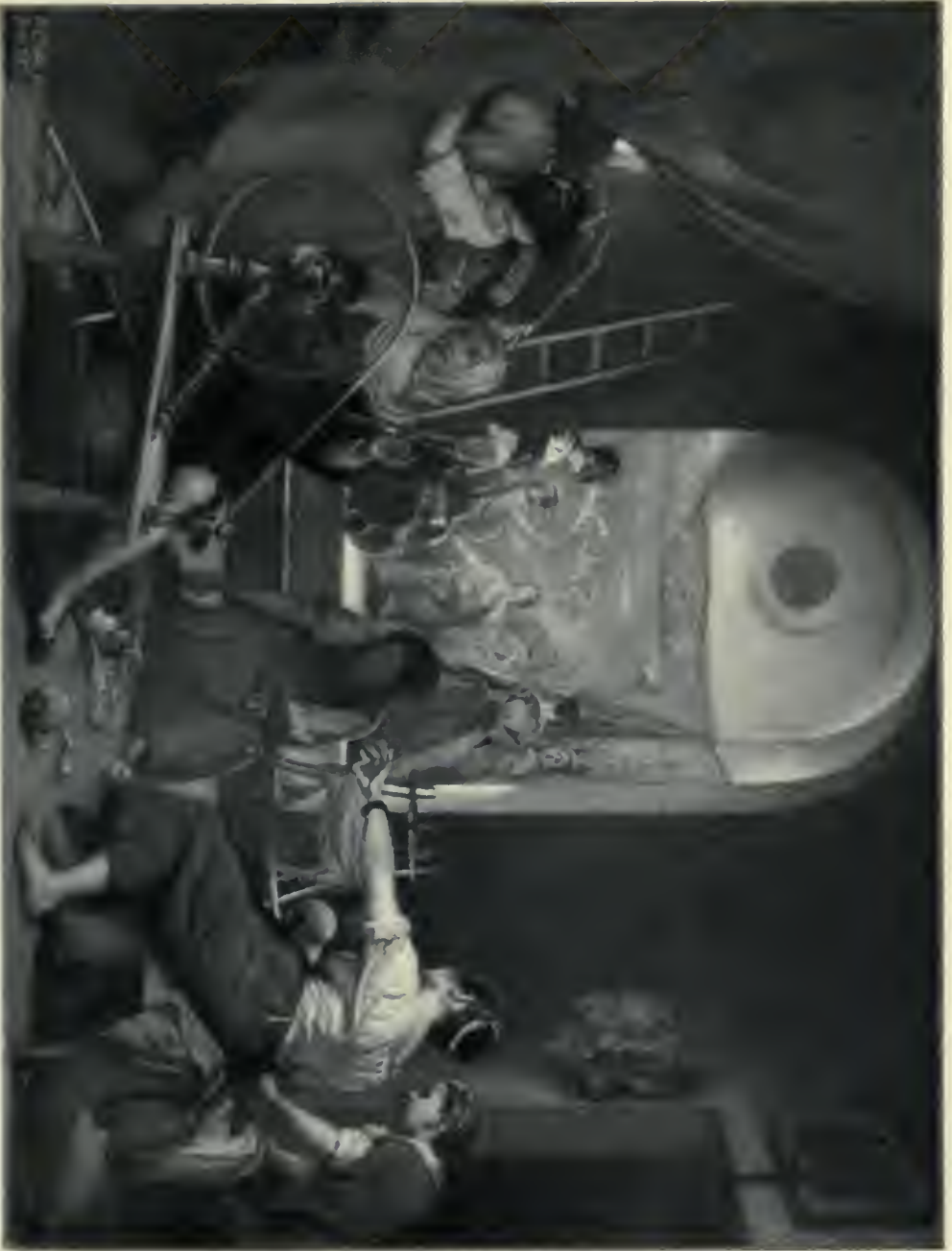
“THE SPINNERS.” BY VELASQUEZ. FRANCO DE GOYA, MADRID