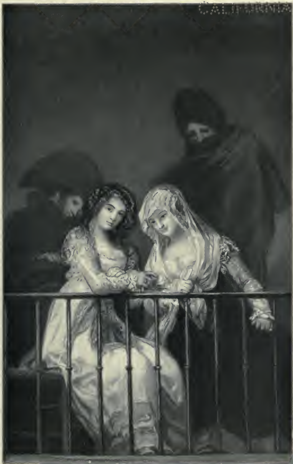
"IN THE BALCONY." BY GOYA. IN THE COLLECTION OF THE DUCHE OF MARCHENA, PARIS.