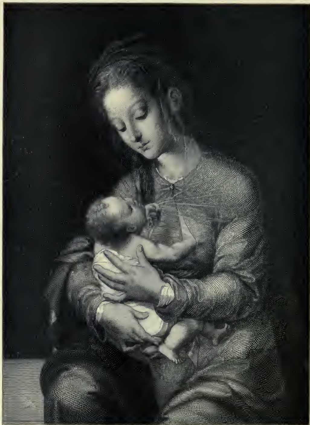
MADONNA AND CHILD. BY LUIS DE MORALES. BOSCH COLLECTION, MADRID.