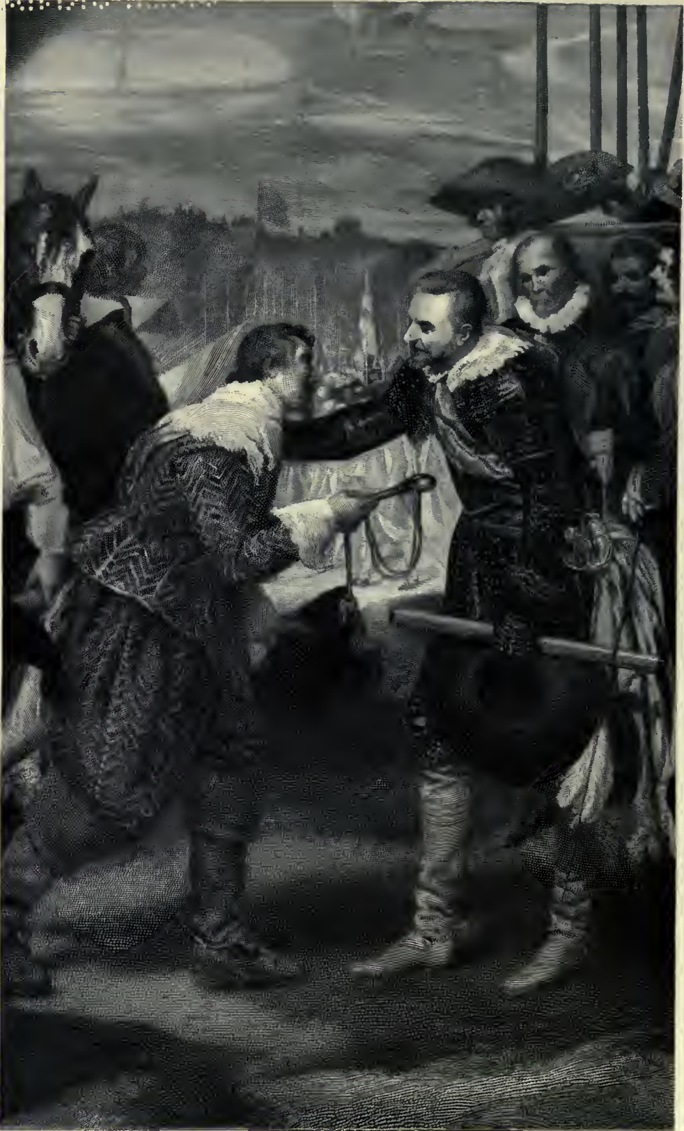
THE SURRENDER OF BREDA (THE LANCES). BY VELASQUEZ.