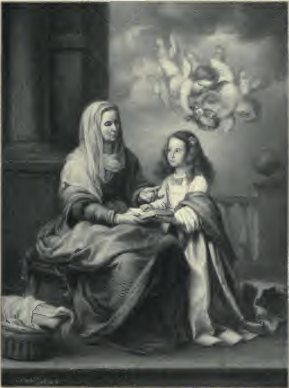
ST. ANNA TEACHING THE VIRGIN. BY MURILLO. PRADO MUSEUM, MADRID.