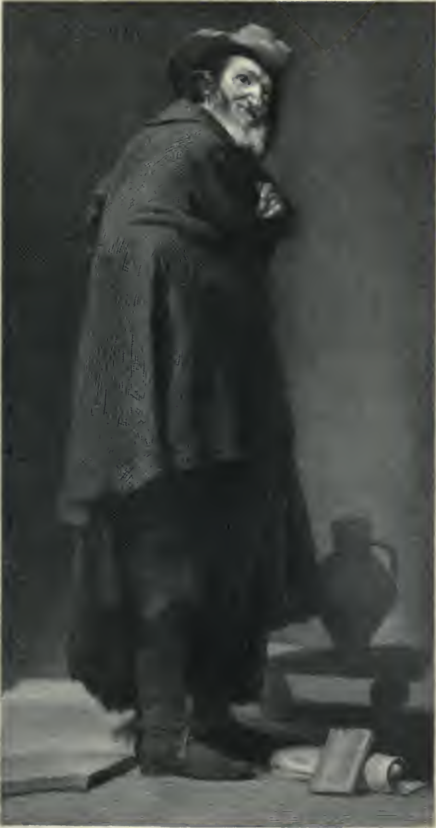
THE MENIPPUS. BY VELASQUEZ. PRADO MUSEUM, MADRID.