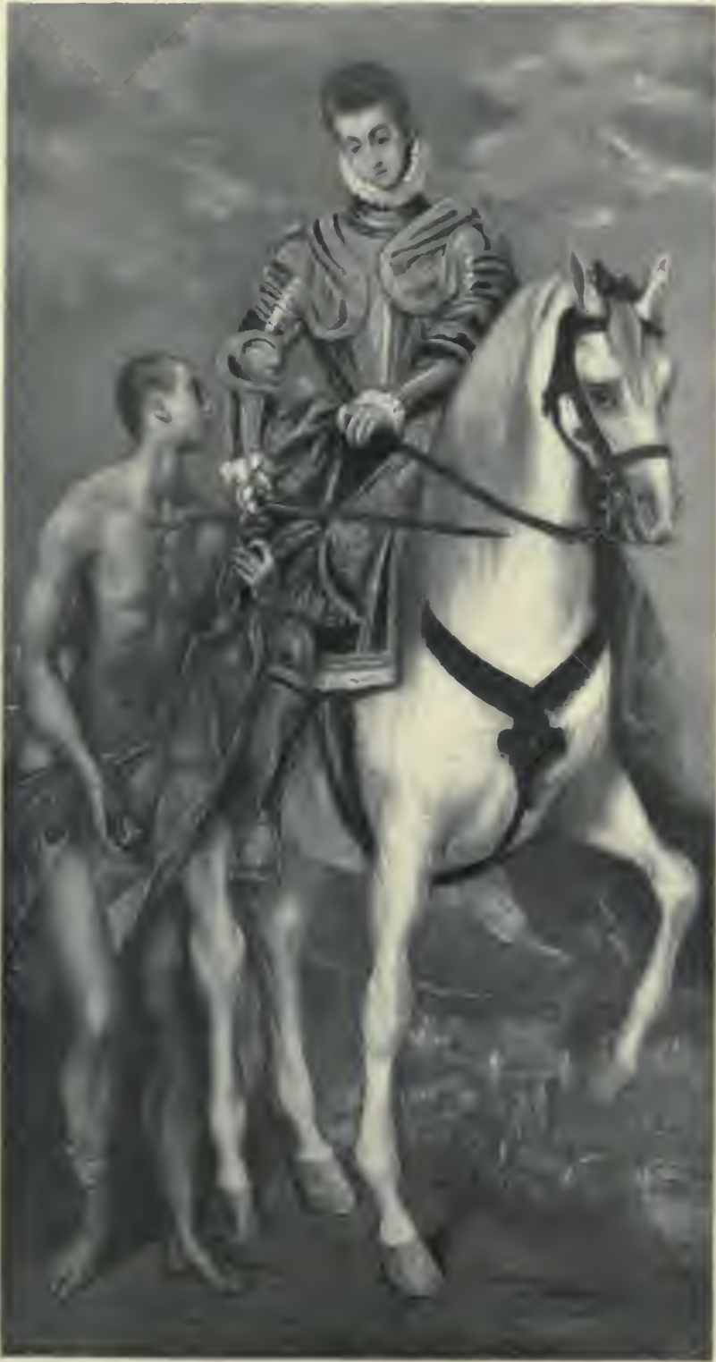
ST. MARTIN AND MENDICANT. BY EL GRECO. IN THE CHURCH OF SAN JOSE, TOLEDO.