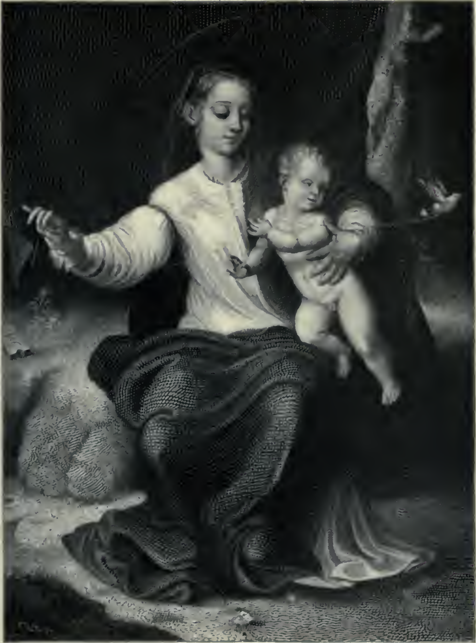
MADONNA OF THE LITTLE BIRD. BY LUIS DE MORALES. IN THE COLLECTION OF THE MARQUÉS DE REMISA, MADRID.