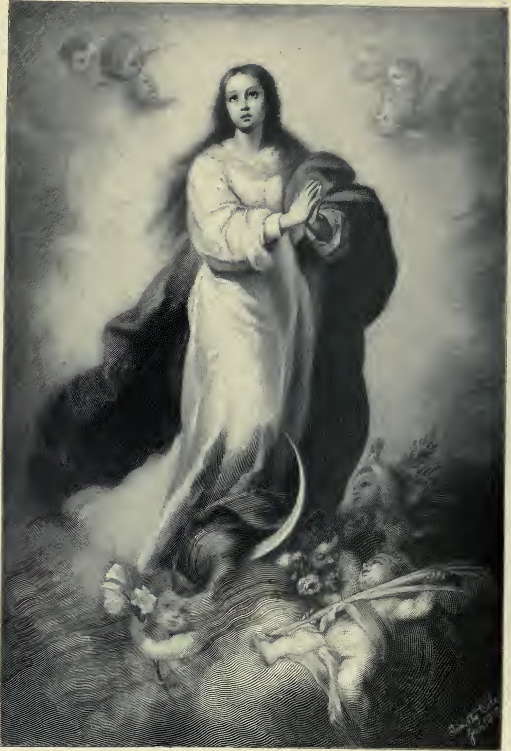
THE CONCEPTION OF THE VIRGIN. BY MURILLO. PRADO MUSEUM, MADRID.