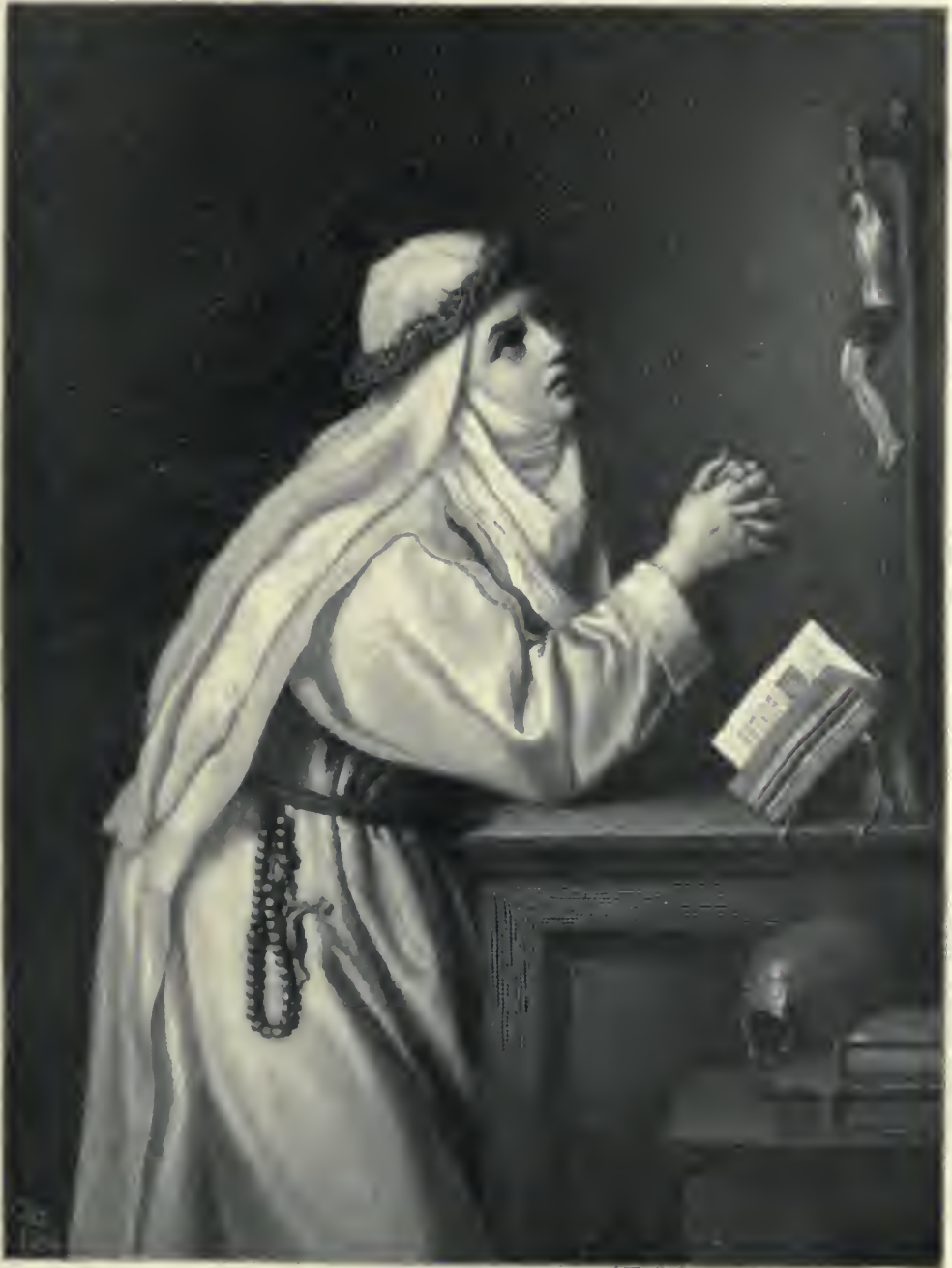
ST. CATHARINE IN PRAYER. BY ZURBARAN. THE COLLECTION OF THE INFANTA.