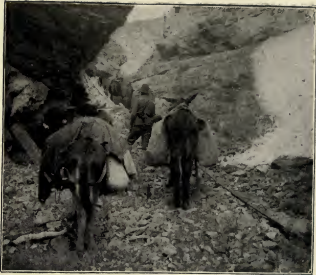
"Through Devil's Gate, their panniers scraped the walls."