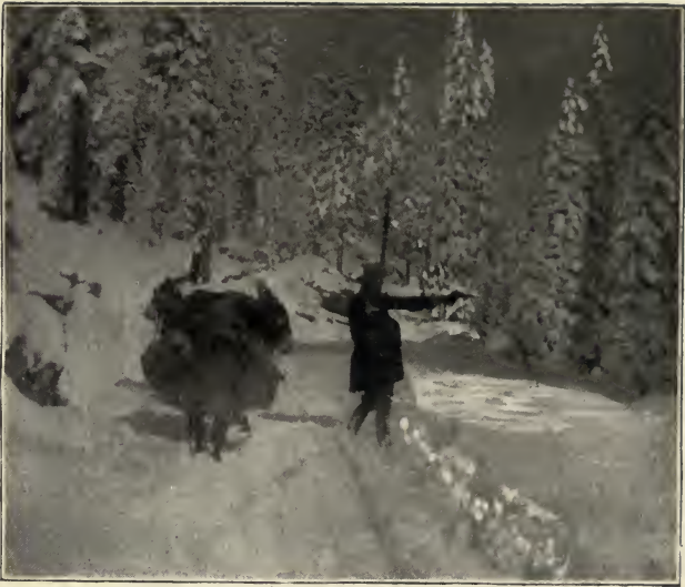
"Began to plow Snow toward Placerville."