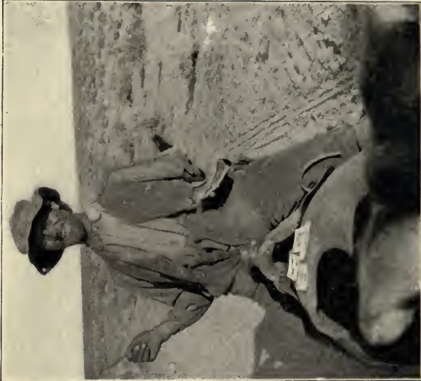
"Playing Solitaire on Damfino's broad back."