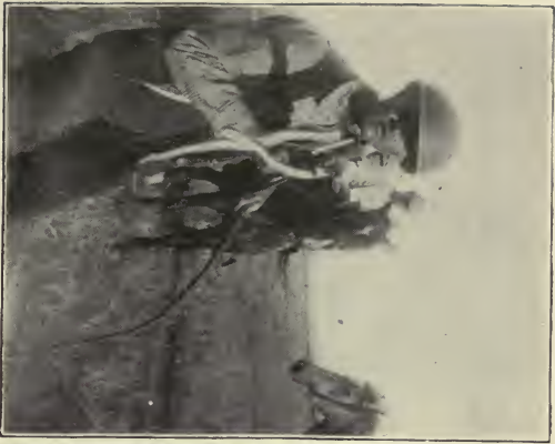
"I killed my first rattlesnake."