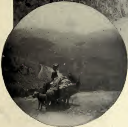
"Two days of hard climbing to cross Western Pass."