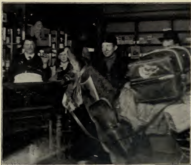
"I found the captive drinking with other jackasses."