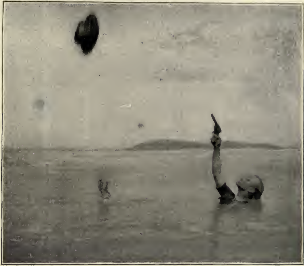
"And floated on Salt Lake."