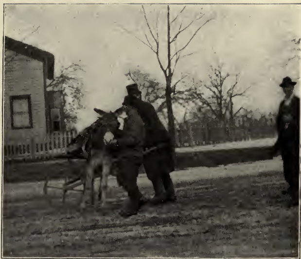
"We consumed a half hour in the gigantic task."