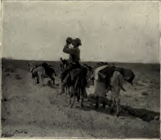
"The last and only drop."