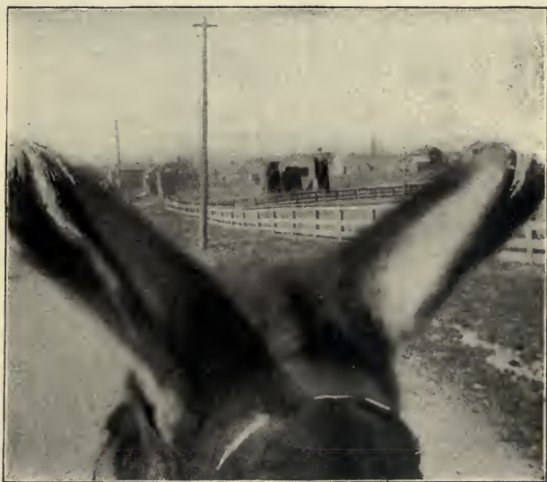
"Only time I got ahead of him."