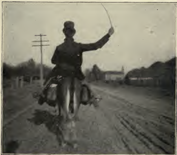
"We made slow headway to the Mississippi."