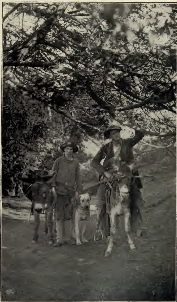
"Through thickets, tangled roots and fallen trees."