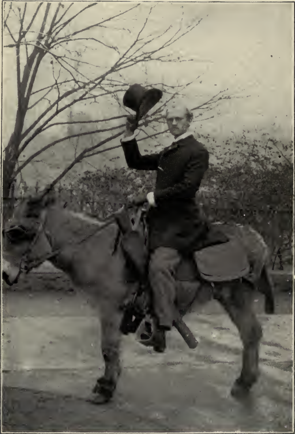
"I bade my friends farewell."