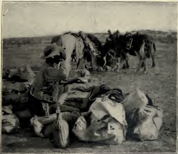
"Skull Valley desert; we stopped to feed and rest."