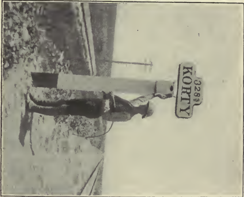
"That was the town."