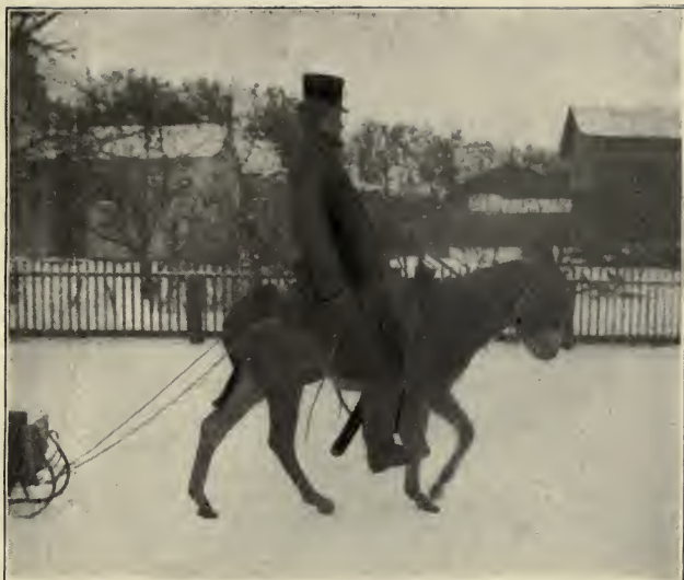
"Mac could draw my luggage instead of carrying it."