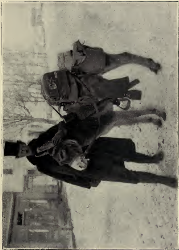
"We tramped tired and footsore into the village."