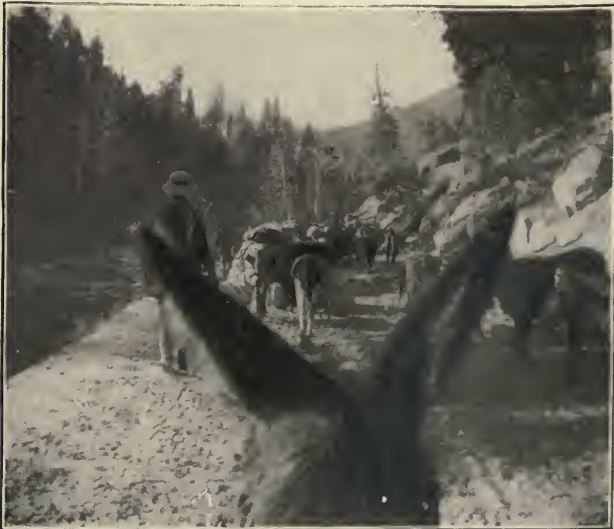
"The Cattle Passed Us."