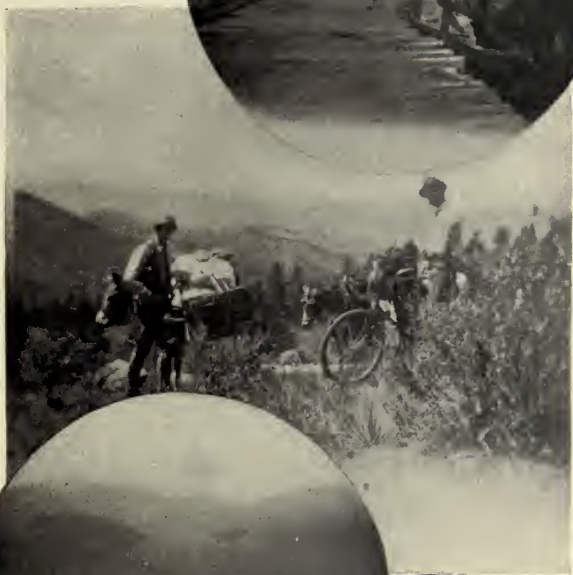
"Trail to Florisant."