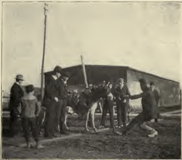
"He accused me of attempting suicide."