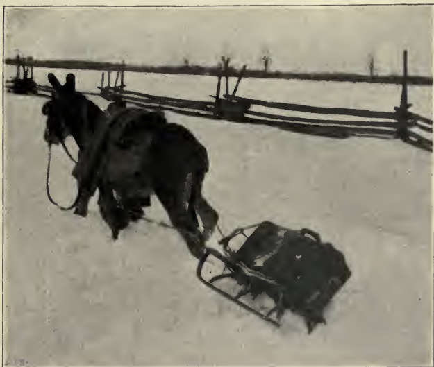
"Mac's little legs would get stuck."