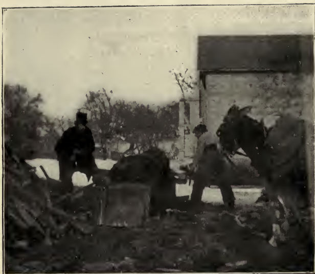
"Mac supervised the work."