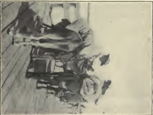
"Over the Platte . . . after blindfolding them."