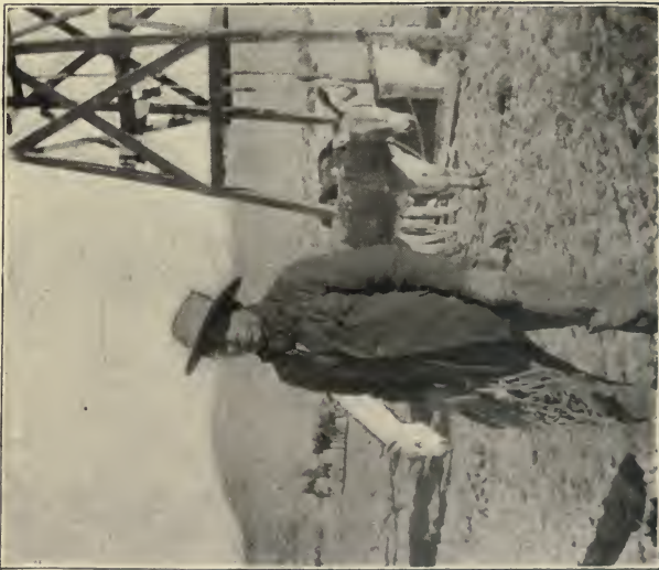
"Some Pinte Indians who had camped close by."