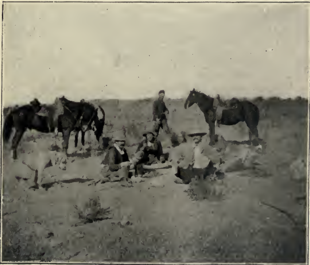
"Just finished lunch when the posse arrived."