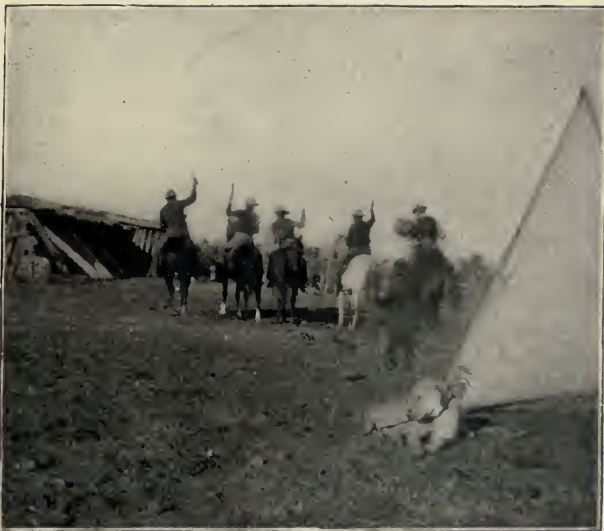
"Fired their revolvers in the air."