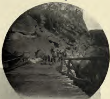
"Independence Pass. . . one of the loftiest of the Continental Di- vide."