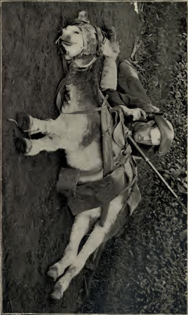
"Conskin and I took shelter behind our donkeys."