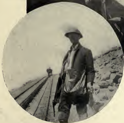
"Climbing Pike's Peak."