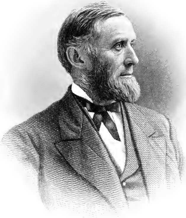
Charles Carleton Coffin