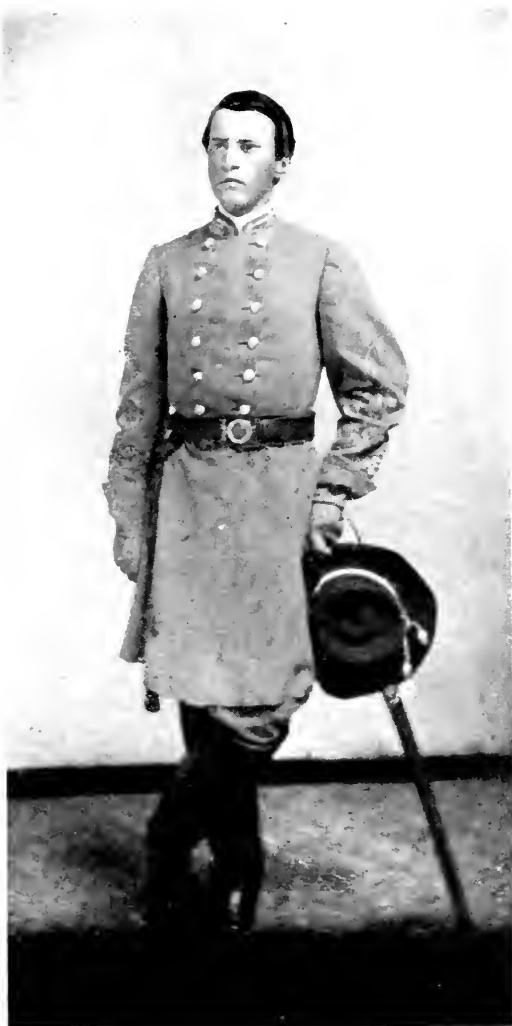
FOURTH CAPTAIN WILLIAM A. PEGRAM