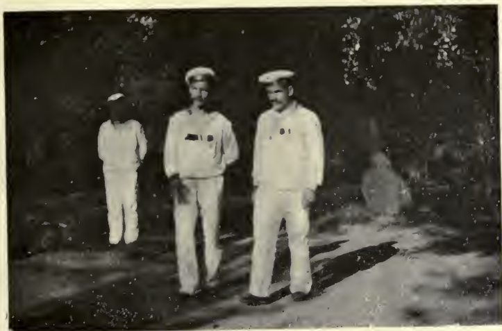
CRONSTADT—TWO SURVIVORS OF THE GLORIOUS KOREITZ