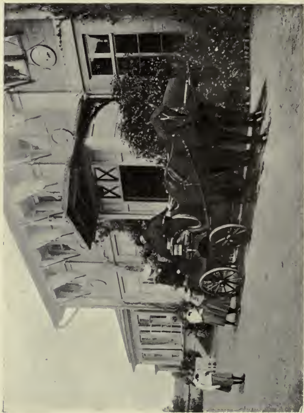
MONREPOS — "THE CHAR-À-BANCS"