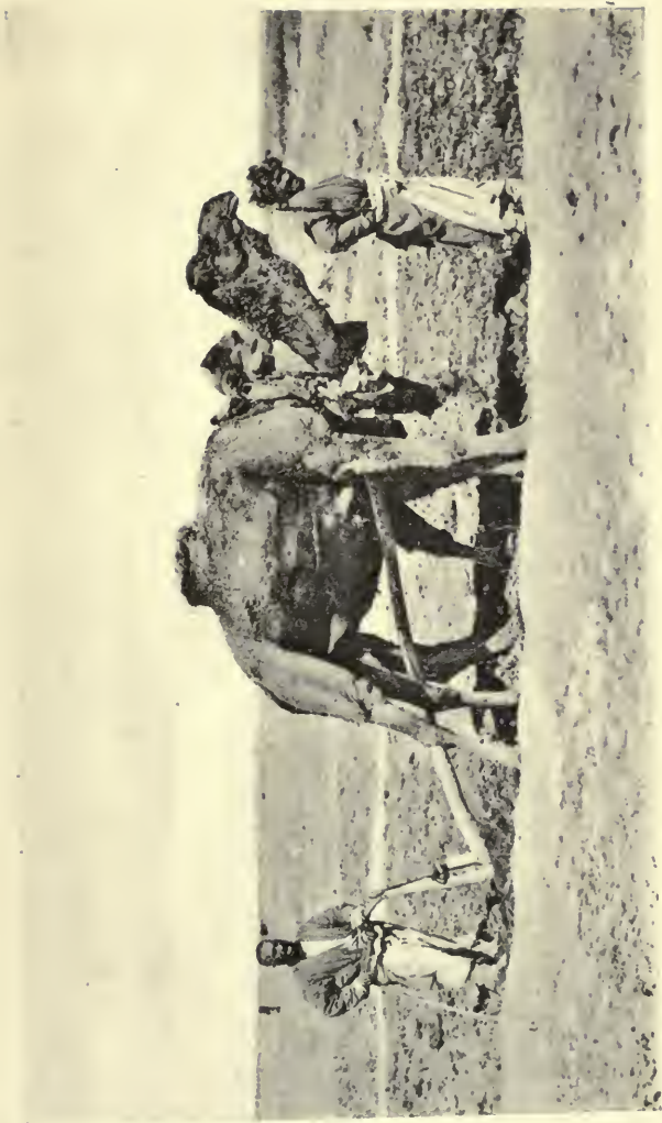
PLOUGHING IN THE CAUCASUS