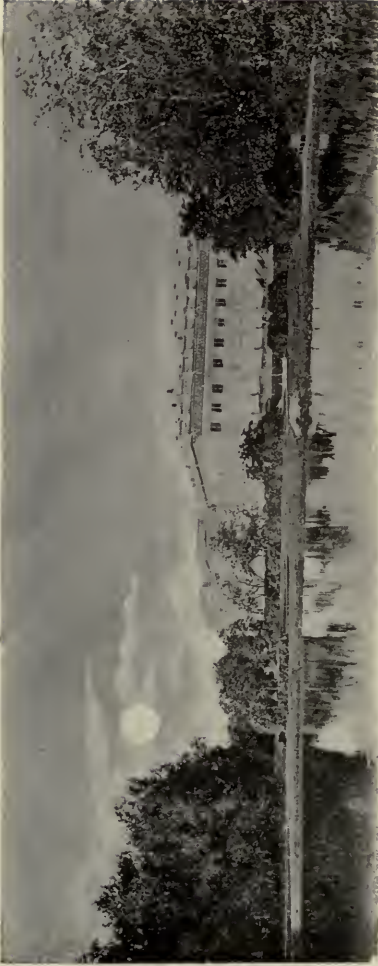
THE IMPERIAL PALACE OF TSARSKOË-CELO