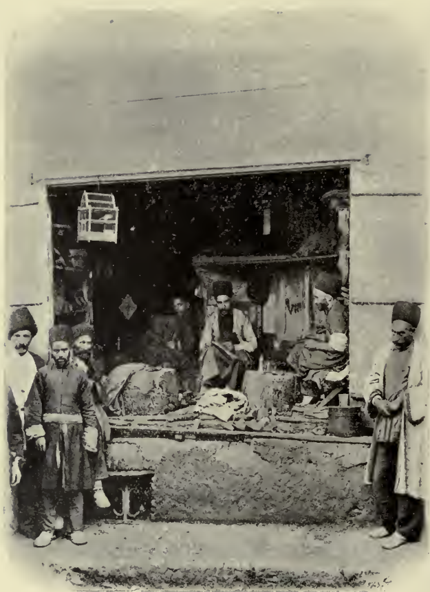
TIFLIS—A PERSIAN SHOEMAKER'S SHOP