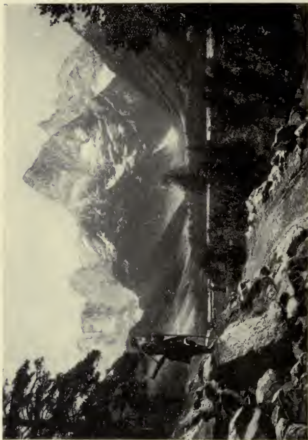
IN THE MOUNTAINS OF THE CAUCASUS