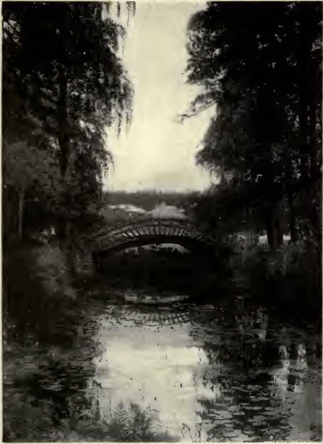
THE CASTLE OF MONREPOS FROM THE PARK