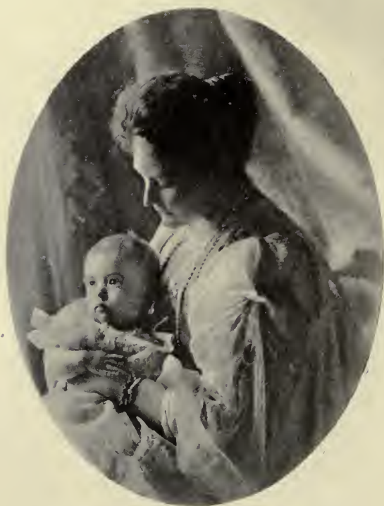
THE EX-EMPRESS ALEXANDRA FEODOROVNA OF RUSSIA WITH THE EX-TZAREVITCH ALEXIS