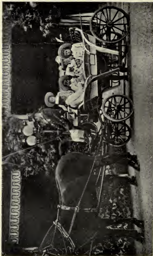
PETERHOF, THE IMPERIAL CHILDREN