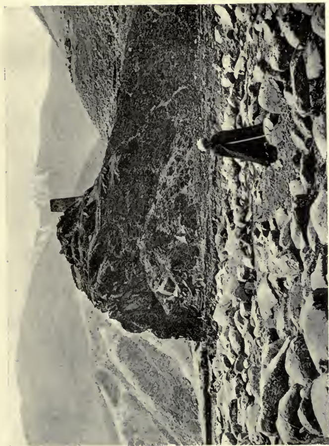
SCENERY IN THE CAUCASUS