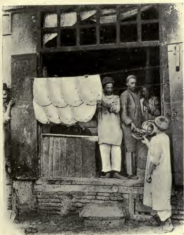
TIFLIS—A PERSIAN BAKER'S SHOP