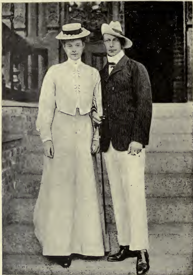
THE CROWN PRINCE OF GERMANY WITH PRINCESS CECILIE AS FIANCÉS