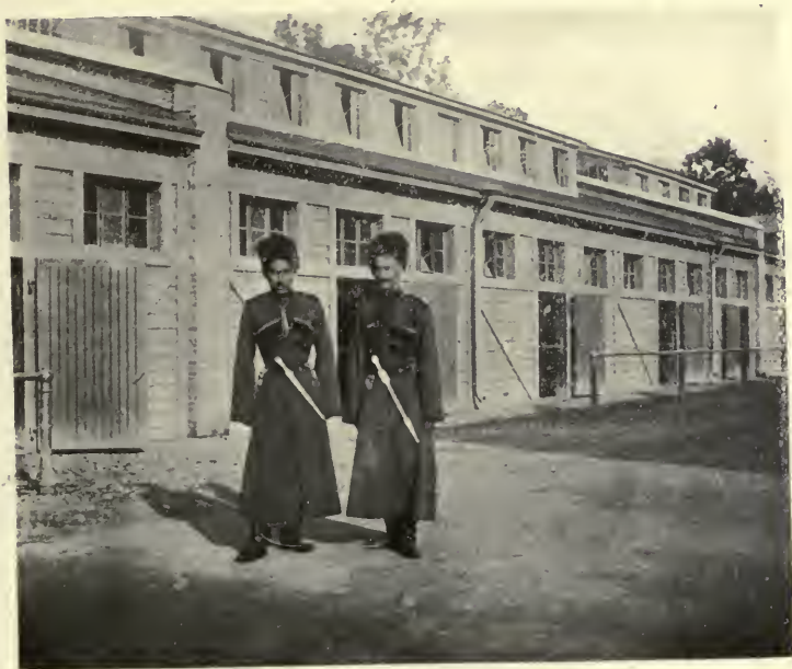
THE BARRACKS AT PETERHOF, TWO COSSACKS OF THE ESCORT