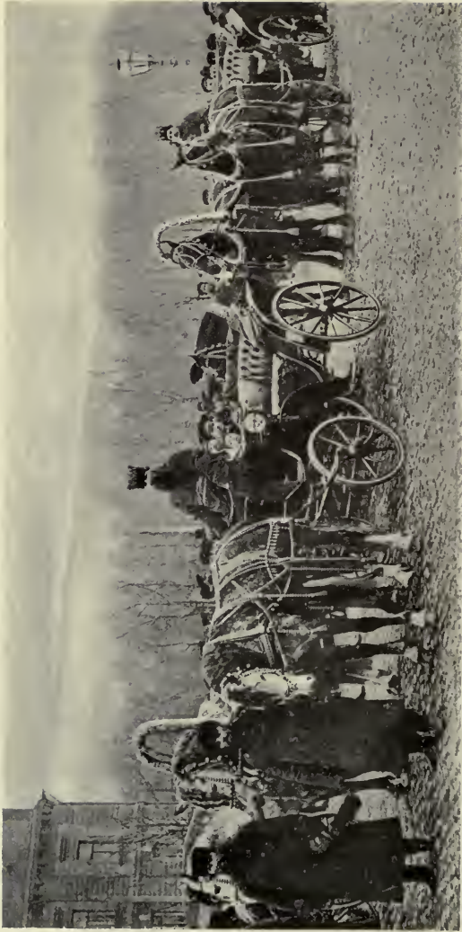
RUSSIAN EQUIPAGES—TWO TROİKAS (THREE HORSES)