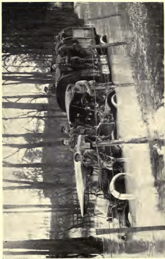
MECHANICAL TRANSPORTS IN SALISBURY FLOODS.