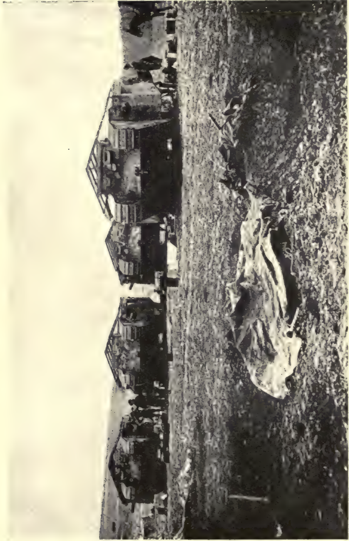
BRITISH TANKS AS USED IN THE FLANDERS OFFENSIVE.