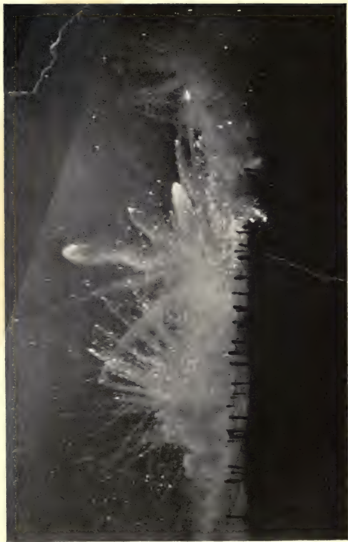
GERMAN BARRAGE FIRE AT NIGHT.