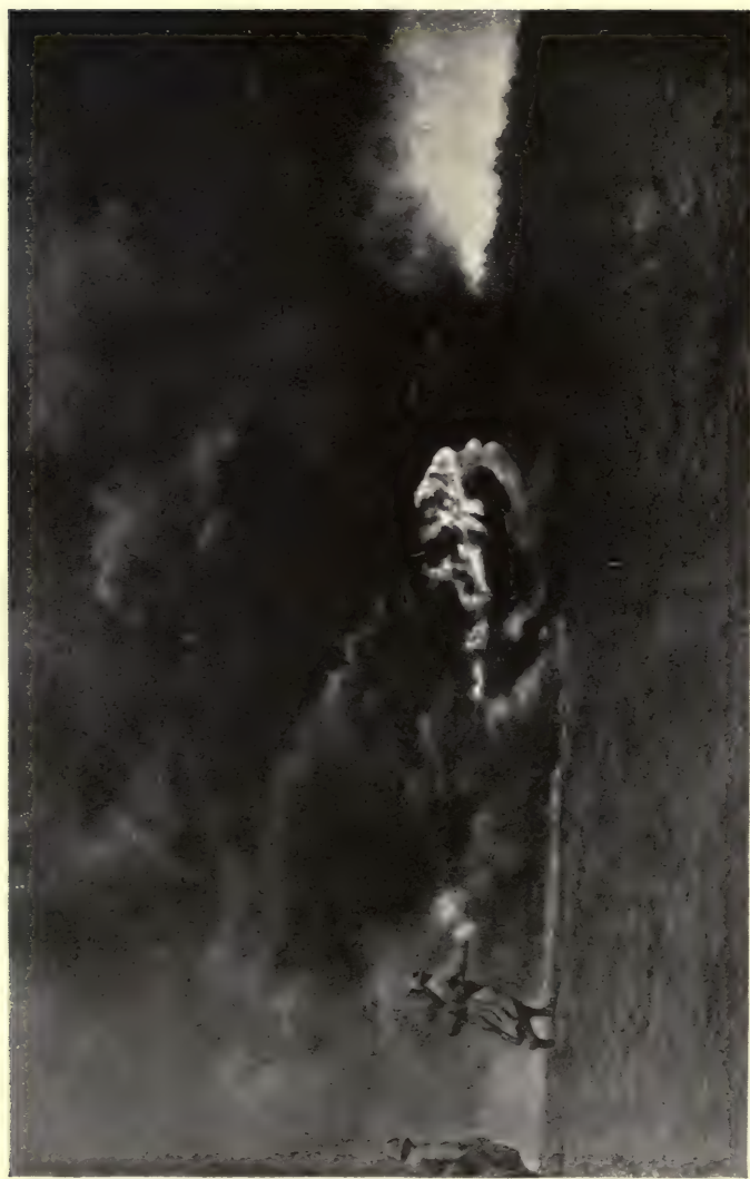
FRENCH SOLDIERS ADVANCING UNDER COVER OF LIQUID FIRE.