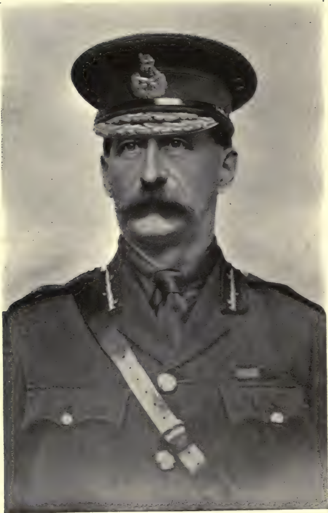
MAJOR-GENERAL M. S. MERCER, C.B. Former Officer Commanding Third Canadian Division. Killed in action, June, 1916.