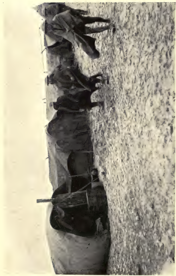
“HOME, SWEET HOME”—MUD TERRACE.