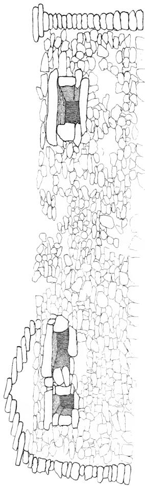
LONGITUDINAL SECTION OF OUTER CURVE.