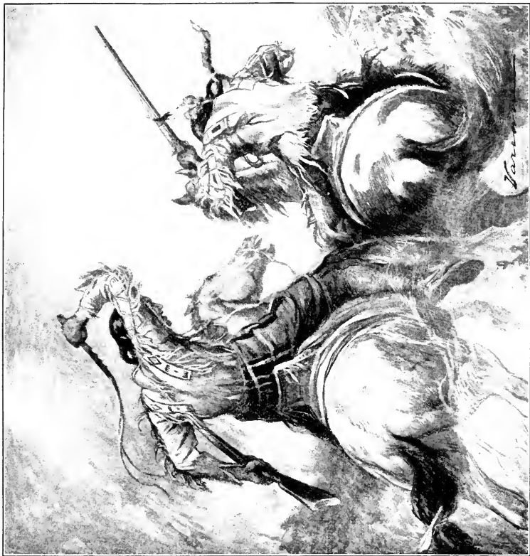
BEGAN TO QUIRT HIM UNMERCIFULLY