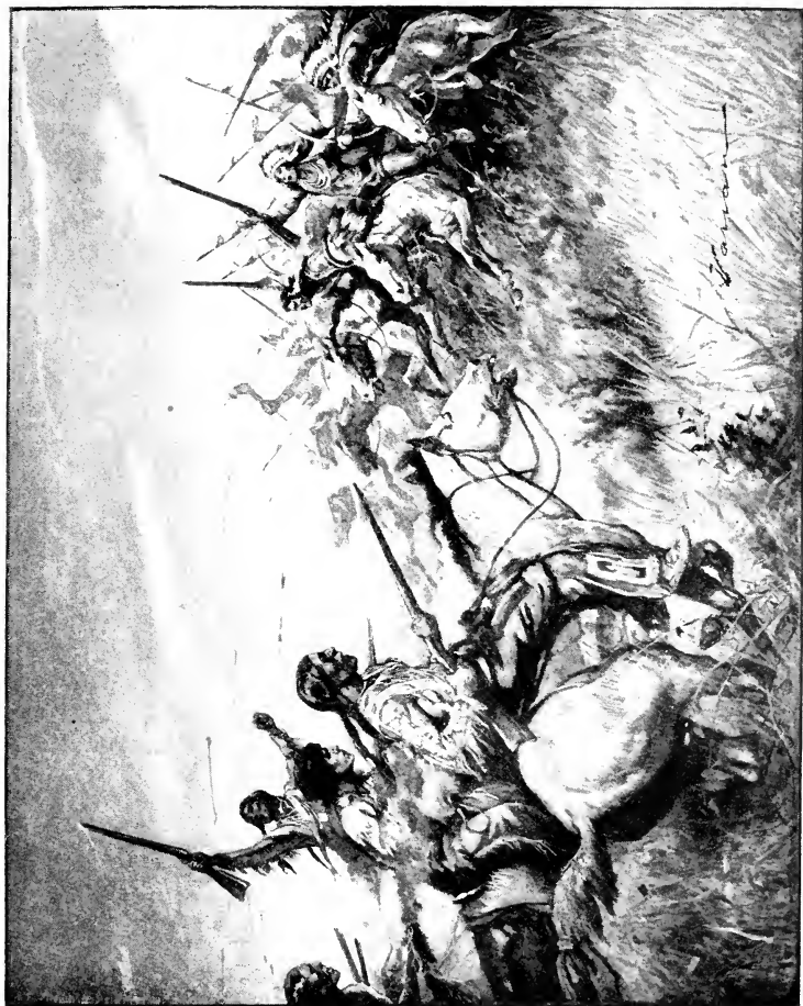
WE CAME TOGETHER WITH A SHOCK