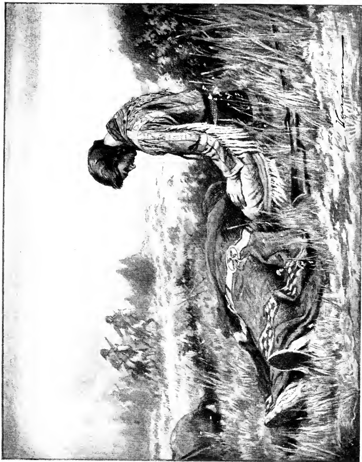
SITTING MOTIONLESS NEAR THE BODY