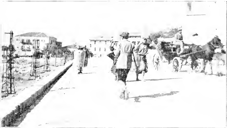
JERUSALEM'S LEADING STREET, JAFFA ROAD.

is acceptable to him." This discovery was of world-wide significance in its results. About a mile from the old town is the Russian settlement where the location of the house of Tabitha, or Dorcas is shown as well as her tomb. The spacious grounds are enclosed with a good wall and a substantial iron gate. But once inside one feels that its caretakers believe in order, cleanliness, and comfort. It is one of the bright spots of the city of Jaffa. Within its enclosure are orange, fig, and olive trees; vegetables and flowers; shady walks, tables and benches for those who may wish to enjoy a glass of tea in the open in the cool of the afternoon; rooms for pilgrims, and a fine church with a very tall steeple, or tower. The walls of this