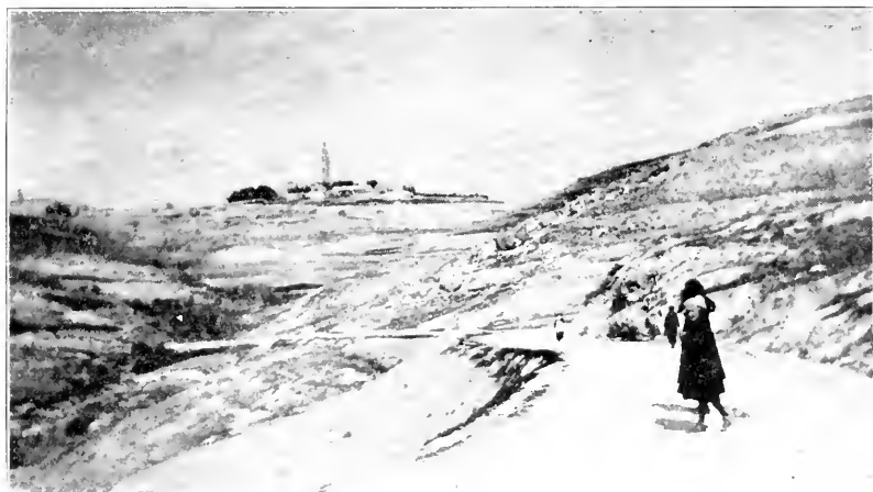
RUSSIAN TOWER ON MOUNT OF OLIVES FROM JANCHO ROAD.

cured from the peasants they despised. Her hosts of monks are in a semi-starving condition because they have not learned the art of useful toil. Their laziness was their undoing. Had these monks carried out the Apostolic injunction, "to do your own business, and to work with your hands, even as we charged you; that ye may walk becomingly toward them that are without, and may have need of nothing," they would today be independent of outside aid, have the respect of those who are without, have enough food and raiment for themselves and for their poor, and would have been a shining light of industry and thrift to their many followers. I suggested this to some of them and they were candid enough to admit the folly of their past life. Perhaps the fall of Russia may not be alto-