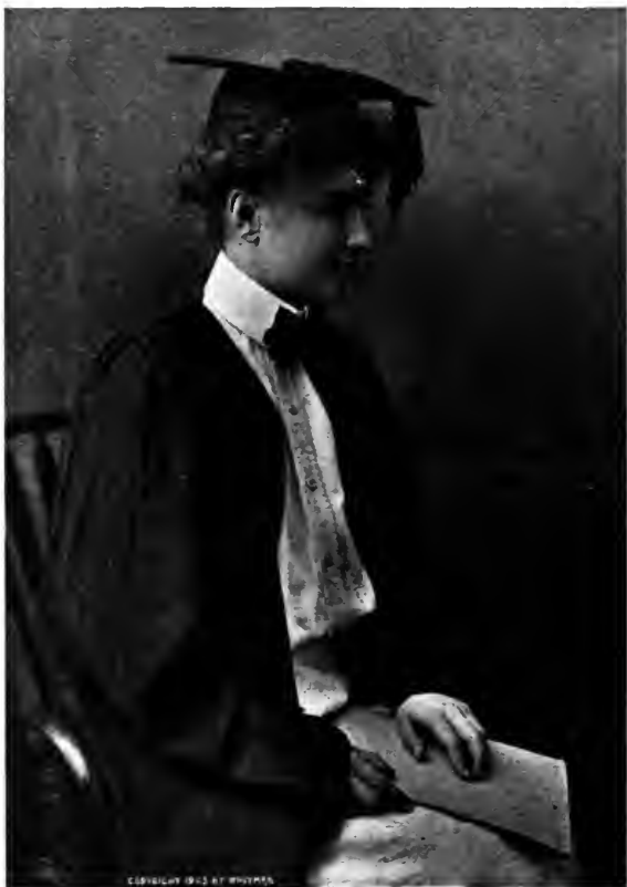
COPYRIGHT 1915 BY WHITMAN