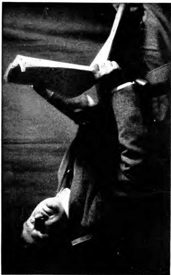
O. Henry. A characteristic photograph