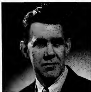
WILLIAM PELZ Theory