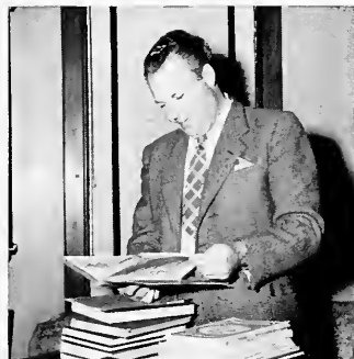
JULIUS HUEHN Voice