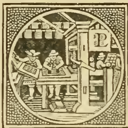
THE LEADENHALL PRESS, LONDON, E.C.

“ Quorum potentia intellectualis immediate à Deo agitata creditur, prophetæ dicuntur; quorum voluntas heroës; at quorum intellectus et voluntas censetur agitata à potentiis invisibilibus dependentibus, appellantur magi.” — CHRIST. THOMASII, in Brunck, Hist. Phil. v. 512.