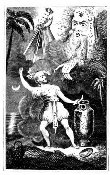
break with mete respect since i am about to kill ince