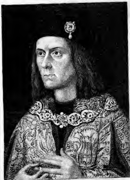
Richard 3 Rex tertius.